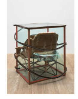
Jessi Reaves Redemption island standing table, 2019 Plexiglass, leather, wood, fabric, sawdust, wood glue, glass, rubber, driftwood 42\ 1/4 \times 45 \times 38\ 1/2 in. (107.32 \times 114.30 \times 97.79 cm)