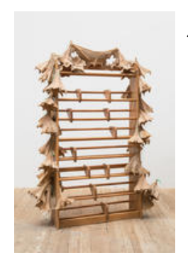
Jessi Reaves Permanent single action, 2019 Oak, sawdust, wood glue, nylon string, wood, wicker 64 × 47 × 19 in. (162.56 × 119.38 × 48.26 cm)