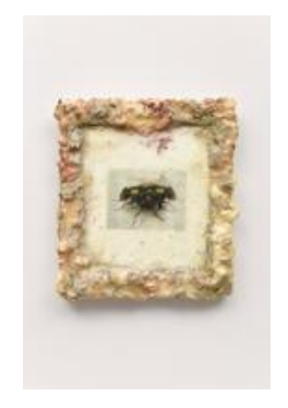
John Russell Fly, 2018 Acrylic photo-transfer on fiberglass, resin and styrofoam 28\ 1/2 \times 26 \times 3\ 1/2 in. (72.39 \times 66.04 \times 8.89 \text{ cm})