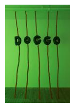
John Russell D-O-G-G-O , 2018 Birchwood, acrylic paint, Jesmonite and two-part polyester resin 134 \times 71 \times 41/2 in. (340.36 \times 180.34 \times 11.43 \text{ cm})