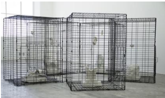
Jaulas, 2017 Metal, Hydrocal, twine, bone, graphite, pigment 48 × 88 × 138 in. (121.9 × 223.5 × 350.5 cm) Courtesy the artist and PATRON Gallery, Chicago