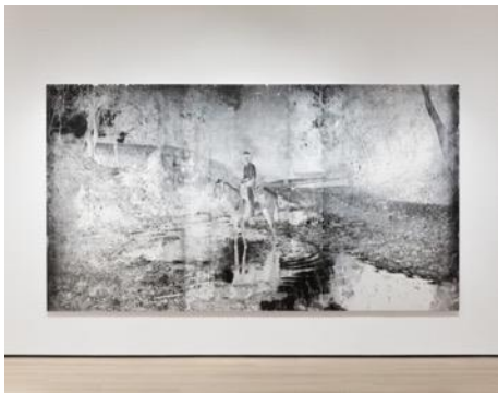
Sin nombre , 2018