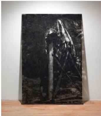
I'm not always fitting (After Koudelka) , 2014/2020