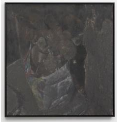
For other days , 2017–18