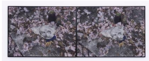
The days of yesterday are all numbered in sum..., 2019 Archival pigment print and graphite mounted on Dibond Diptych, 32 ½ × 42 ¾ × 1 in. (82.6 × 108.6 × 2.5 cm), each; overall dimensions variable