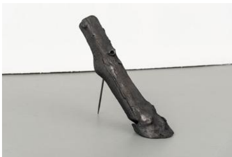
Comma , 2019

Wood, cochineal, graphite, indigo, colored pencil and steel 12 × 17 × 3 5/8 in. (30.5 × 43.2 × 9.2 cm)