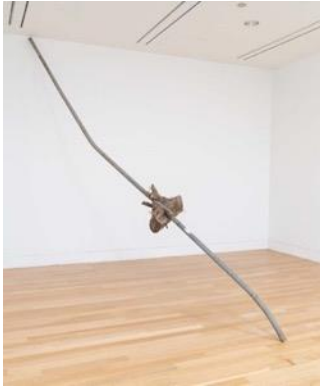
but I sound better since you cut my throat, 2017 Reclaimed galvanized steel, wood, chain link fence Approx. 180 in. (452.7 cm) long Courtesy the artist and PATRON Gallery, Chicago