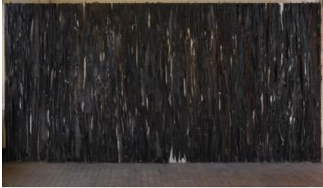
Let the shadows in to play their part , 2012

Eucalyptus bark, black silicon carbide, water soluble ink, marking chalk, spray enamel, latex paint