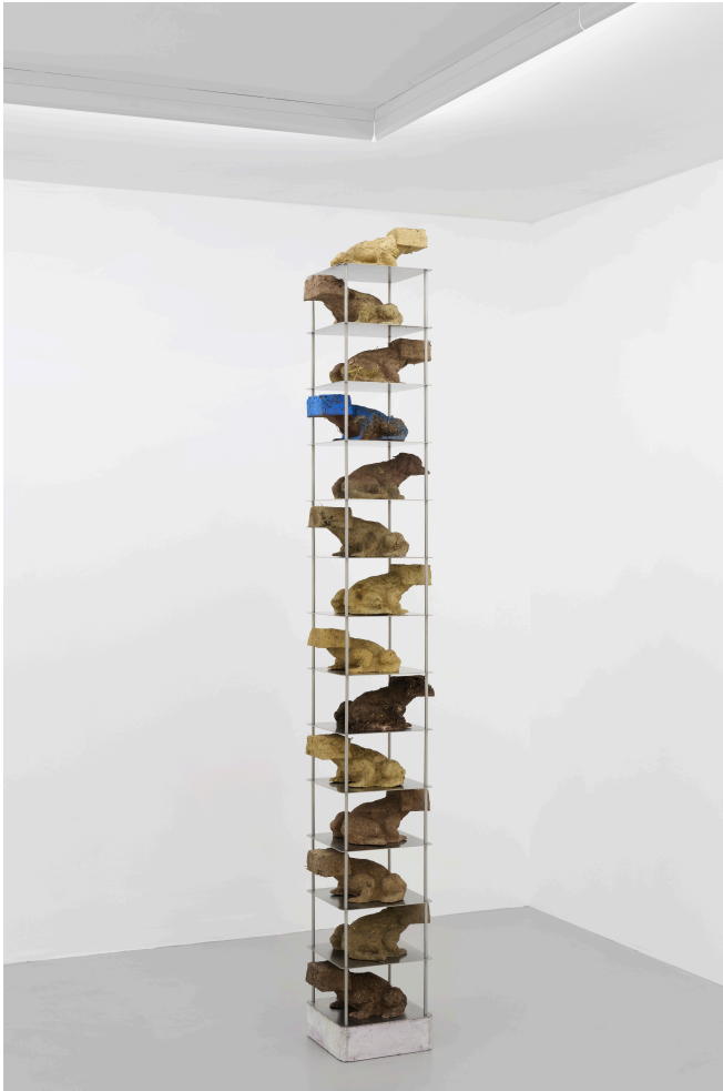
Tooth of a Giant, 2020 Chrome steel, clay, humus, hay, acrylic binder 248 x 35 x 35 cm / 97.6 x 13.8 x 13.8 in

+41786599193 PHILIPP@PHILIPPZOLLINGER.COM WWW.PHILIPPZOLLINGER.COM