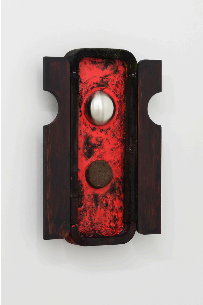
Bridges (red) , 2020

+41786599193 PHILIPP@PHILIPPZOLLINGER.COM WWW.PHILIPPZOLLINGER.COM