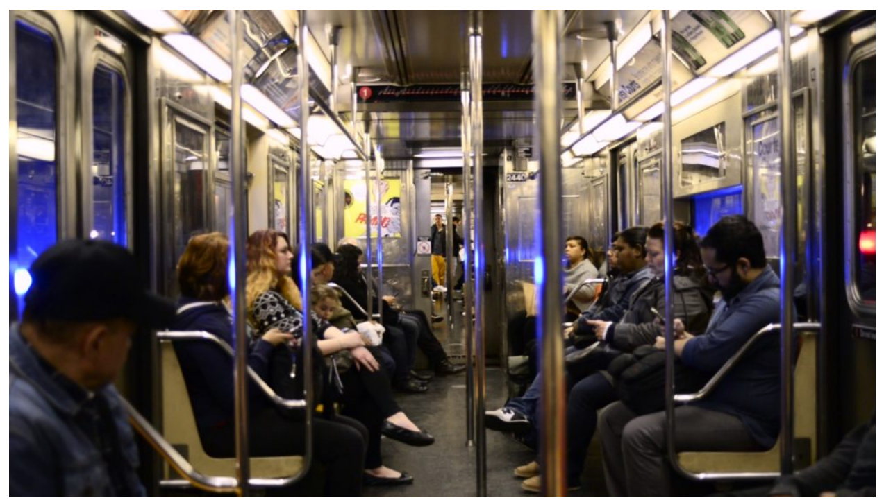
STILL FROM HEMLOCK FOREST, 2016.