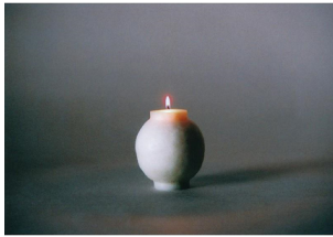
rinntohitsuji "Gabriel" Herbal Candle 11 x 9 x 9 cm