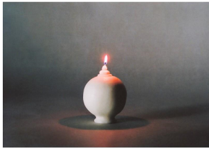
rinntohitsuji "Uriel" Herbal Candle 11 x 9 x 9 cm