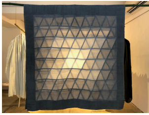
COSMIC WONDER “Harmonic Meditation” 2019 Ramie silk Sumi Dyeing 118 x 108.5 cm