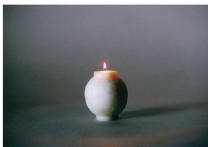
rinntohitsuji “Michael” Herbal Candle 11 x 9 x 9 cm