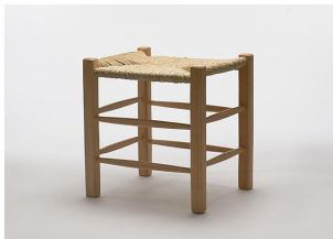
Masaru Kawai Stool Japanese cypress and rush grass 46.3 x 40 x 37.2 cm