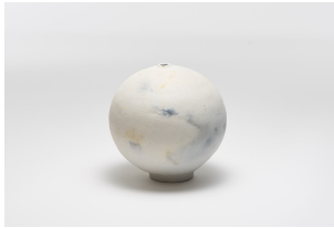
Miyakono Yasuda “Sound of Light #1”2019 Ceramic 21 x 21 x 21 cm