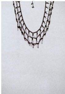
Yasuhide Ono “Ripples of Light” Brass, double pointed quartz 49 x 60.3 cm