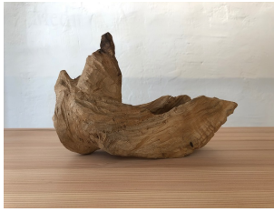
Hiroki Tashiro “Angelus”2019 Camphorwood 16 x 25 x 7 cm