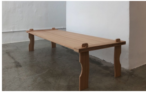
Masaru Kawai Low table Japanese cedar 51.5 x 128.5 x 30.5 cm