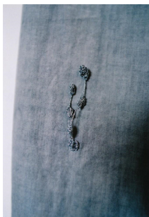
Kaoru Yokoo Dress – Sumikuro / Rose Aura / Ruby Lotus / Violet flame