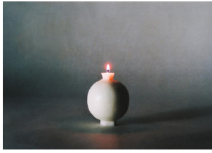
rinntohitsuji "Raphael" Herbal Candle 11 x 9 x 9 cm