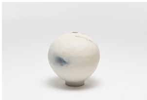
Miyakono Yasuda “Sound of Light #2”2019 Ceramic 13 x 13 x 13 cm