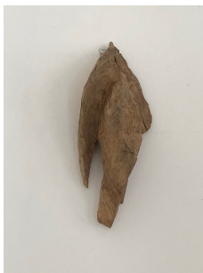
Hiroki Tashiro "Angelus"2019 Camphorwood 32.5 x 13 x 9 cm