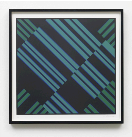
Untitled, 2012 Colored serigraph, 52/125, 65 x 65 cm; 25,5 x 25,5 inches, face signed „Günter Fruhtrunk“, black wooden frame 66,5 x 66,5 cm, 26,1 x 26,1 inches