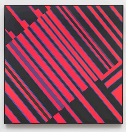
Violette Interferenzen im Rot, 2012 Acrylic paint and vinyl paint on canvas 162 x 163 cm; 63,8 x 64,2 inches