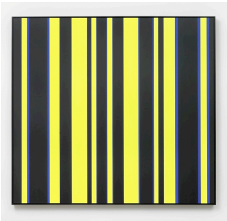
Cantus Firmus, 2012 Acrylic paint and vinyl paint on canvas 152,2 x 166,1 cm; 59,9 x 65,3 inches