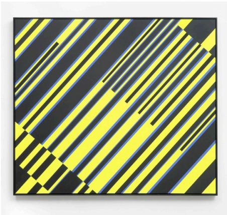
Progression Gelb-Blau-Schwarz, 2012 Acrylic paint and vinyl paint on canvas 132,2 x 150,2 cm; 52 x 59,1 inches