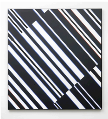
Mit Roten Randzonen, 2012 Acrylic paint and vinyl paint on canvas 202,4 x 190,4 cm; 79,6 x 74,9 inches