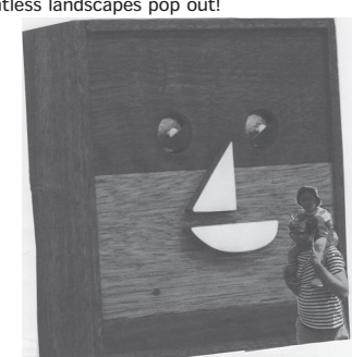
Will Rogan's Boat Swing Roller Coaster

You can ride the birds and animals which have jumped out from Miki's paintings! Merry-Go-Round will spin round and round! If you look at the wall, countless landscapes pop out!