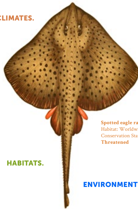
Spotted eagle ray Habitat: Worldwide Conservation Status: Threatened