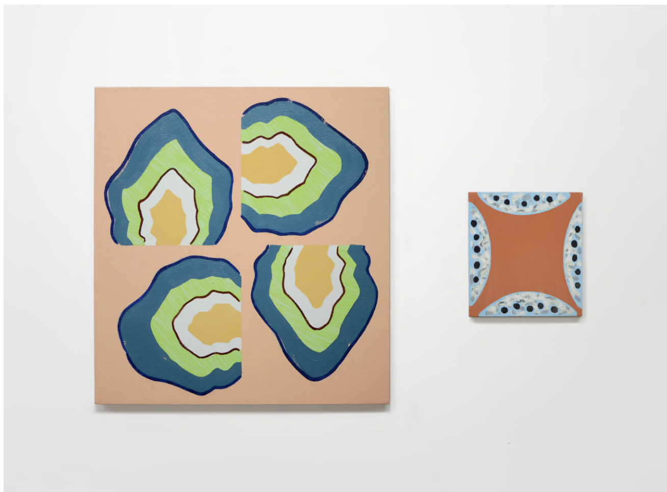
Left : Island , 2020, oil on canvas, 65.5 × 65.5 cm