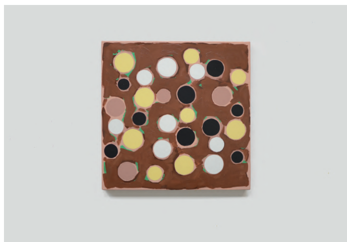
Lead, Lymph, Milk 2020, oil on canvas, 41 x 41 cm