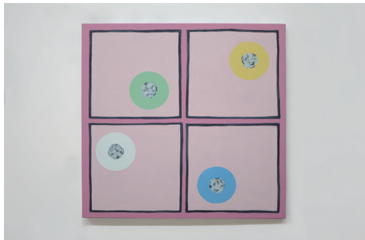
Animal 2020, oil on canvas, 65.5 x 65.5 cm