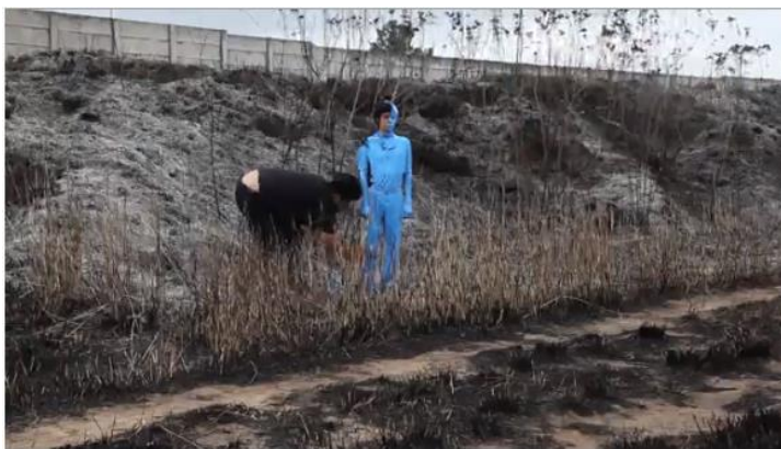
Abstraccion Azul [Blue Abstraction], 2012

Commissioned by One Torino