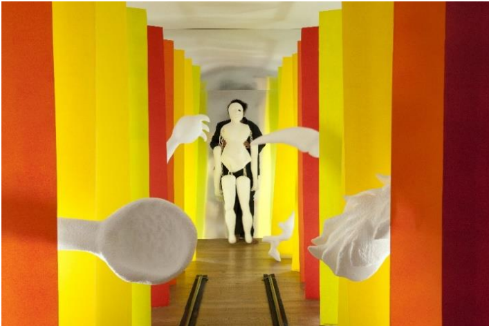
Illusion of Matter , 2015

Commissioned and produced by If I Can't Dance, I Don't Want To Be Part Of Your Revolution and Corpus Network Courtesy the artist