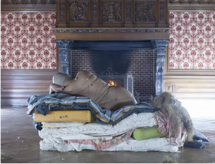
Mimesis of Mimesis , 2016

Video, high definition, colour, sound, 5 min