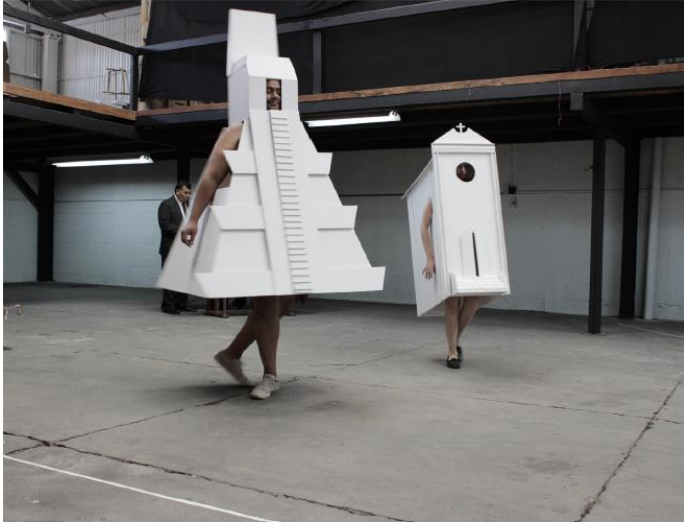
A Brief History of Architecture in Guatemala, 2010-13

Video, high definition, colour, sound, 6 min