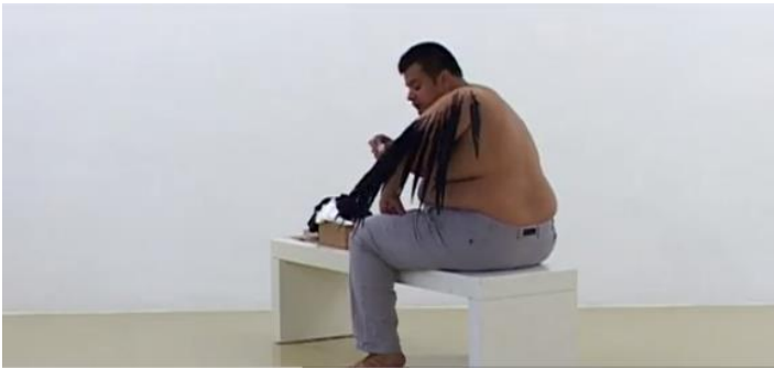
Feather Piece , 2013