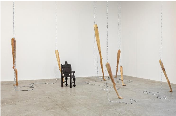
El Sexto Estado [The Sixth State], 2018