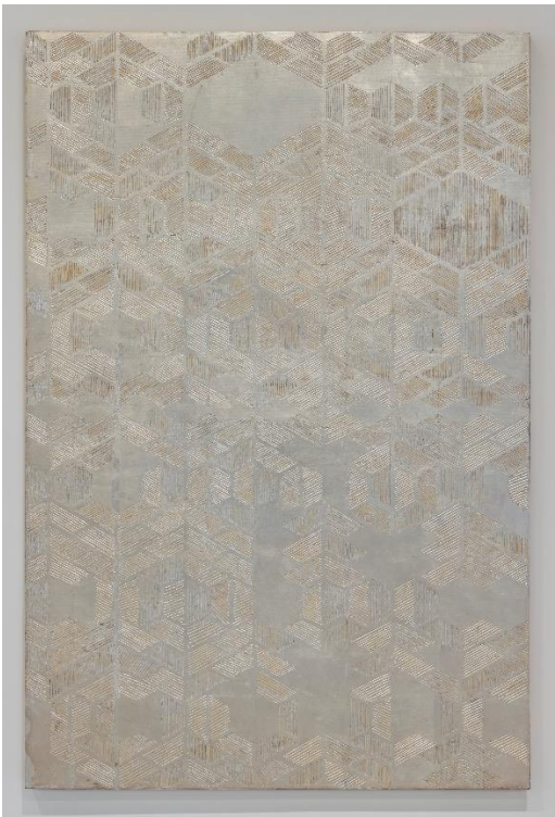
Scales, Variation #2, Silver, 2018