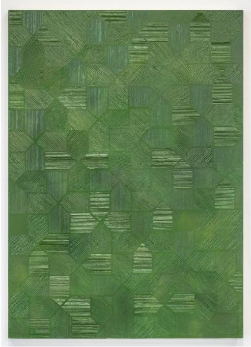
Scales, Variation #4, Nephrite Jade, 2018