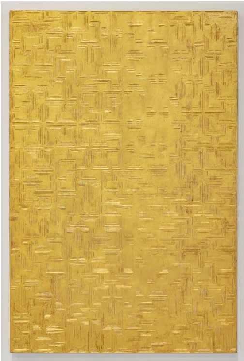
Scales, Variation #1, Gold, 2018