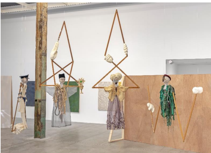
Costumes for Corazón del espantapájaros [Heart of the Scarecrow], 2016

Courtesy the artist and Proyectos Ultravioleta