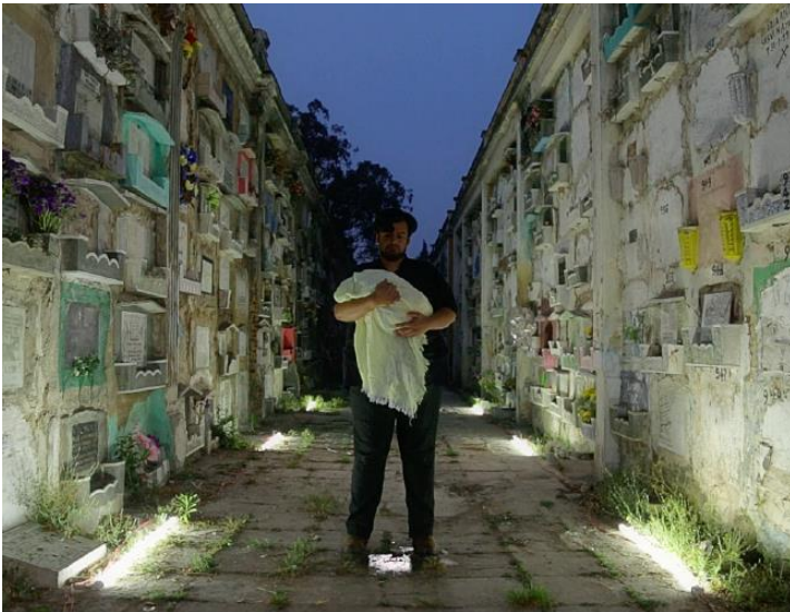
Life in His Mouth, Death Cradles Her Arm, 2016

Commissioned by One Torino for the exhibition at Castello di Rivoli Courtesy the artist