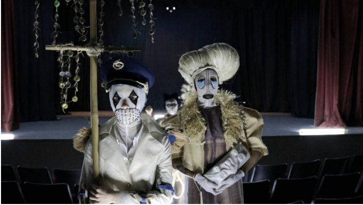
Corazón del espantapájaros [Heart of the Scarecrow], 2020

Video, high definition, colour, sound, 32 min