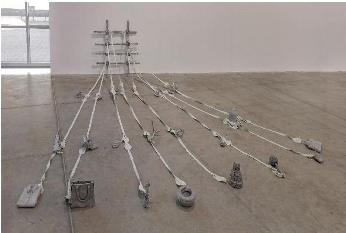
Cacaxte no. 2 (Sarvelia) , 2020

Commissioned and produced by Gasworks, London, 2015