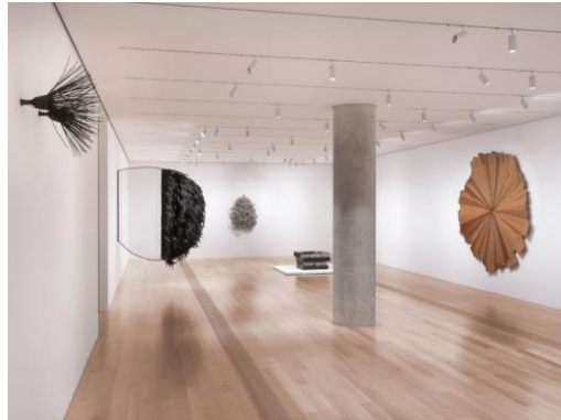
Installation view of Terry Adkins: Resounding

© 2020 The Estate of Terry Adkins / Artist Rights Society (ARS), New York