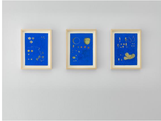
Installation view of Terry Adkins: