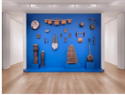
Installation view of Terry Adkins: Resounding

Lower East Gallery, Pulitzer Arts Foundation