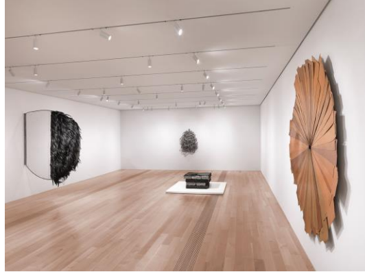
Installation view of Terry Adkins: Resounding

Lower West Gallery, Pulitzer Arts Foundation