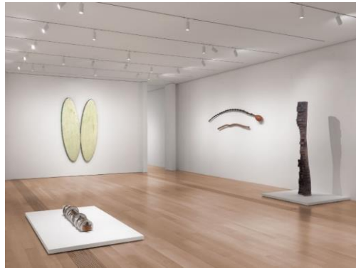
Installation view of Terry Adkins: Resounding

© 2020 The Estate of Terry Adkins / Artist Rights Society (ARS), New York