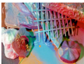
ISABELLE CORNARO Choses , 2014 16mm film (digitalized), color, no sound Ed. 1/3 (+2 AP) CORNA47613