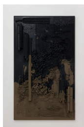
ISABELLE CORNARO Orgon Door I (#5, brown splash) , 2013 Colored elastomer Unique 132 × 79 × 12 cm ( 52 × 31 1/8 × 4 3/4 inch ) CORNA47611