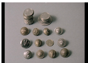
ISABELLE CORNARO Figures , 2011 16mm film (digitalized), color, silent Ed. 1/3 (+2 AP) CORNA34576