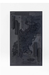
ISABELLE CORNARO Orgon Door I (#1, black) , 2013 Colored elastomer Unique 132 × 79 × 12 cm ( 52 × 31 1/8 × 4 3/4 inch ) CORNA37118