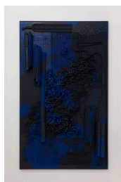
ISABELLE CORNARO Orgon Door I (#4, blue splash) , 2013 Colored elastomer Unique 132 × 79 × 12 cm ( 52 × 31 1/8 × 4 3/4 inch ) CORNA39631