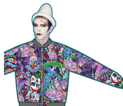
Katie McKay Printed Sweatshirts - $150 Zines - $10 Prints - $10