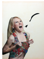
Will Benedict White Woman IV , 2016 Print designed by Katie McKay, gouache on foamcore, archival inkjet print, aluminum, glass, tape 55 x 40 inches (140 x 100 cm) POR