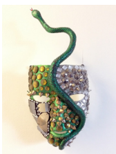
Katie McKay Snake , 2016 Plastic mask, paint, embellishment 12 x 8 x 6 inches (30 x 20 x 15 cm) $100