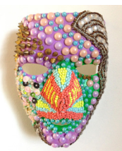
Katie McKay Ancient Aliens , 2016 Plastic mask, paint, embellishment 12 x 8 x 6 inches (30 x 20 x 15 cm) $100