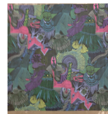
Katie McKay Papua New Guinea Acid Blotter Paper , 2016 Custom printed acid blotter paper 8 x 8 inches (15 x 15 cm) $10