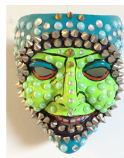
Katie McKay Clown Town , 2016 Plastic mask, paint, embellishment 12 x 8 x 6 inches (30 x 20 x 15 cm) $100