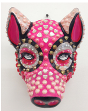
Katie McKay Food Chain , 2016 Plastic mask, paint, embellishment 12 x 8 x 6 inches (30 x 20 x 15 cm) $100