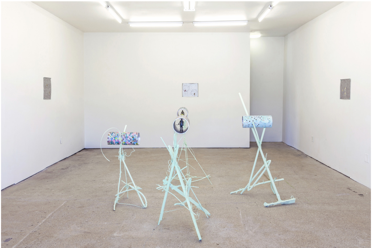
Paul Pascal Theriault Suns Tunnels Installation view