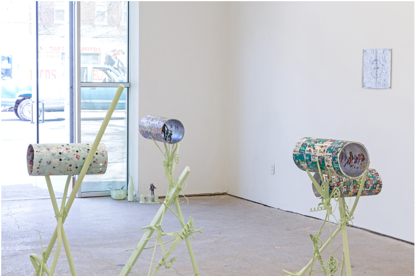
Paul Pascal Theriault Suns Tunnels Installation view