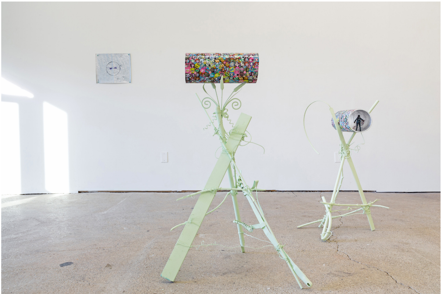
Paul Pascal Theriault Suns Tunnels Installation view