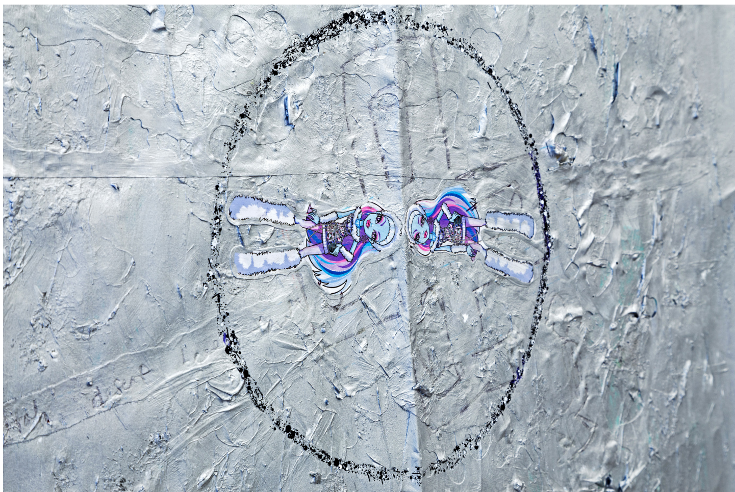
Paul Pascal Theriault Double Abbey Bominable , detail