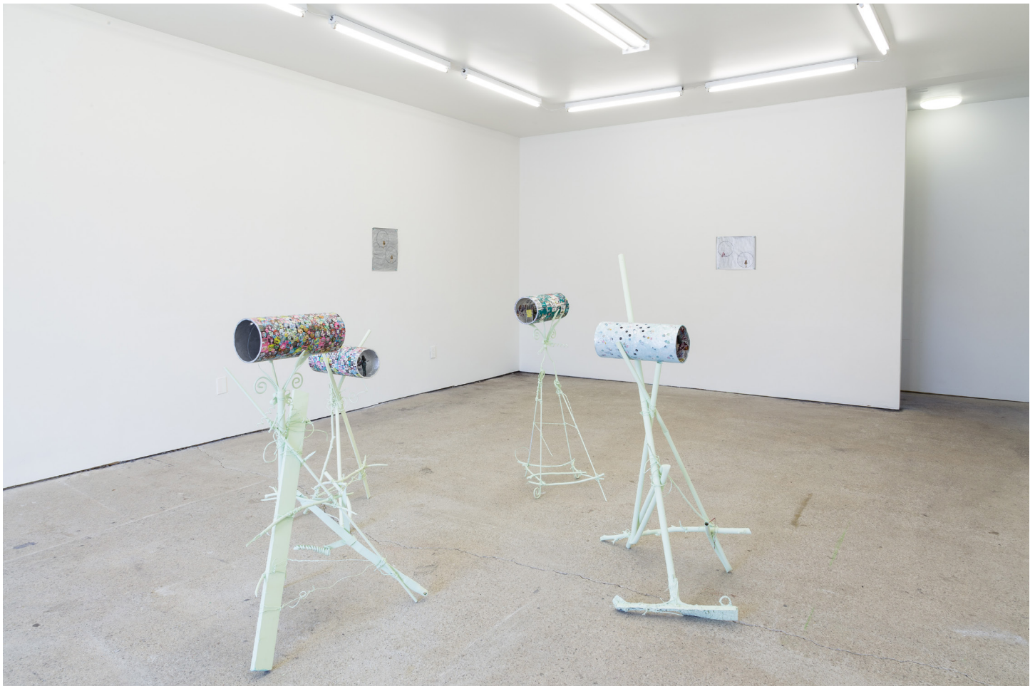
Paul Pascal Theriault Suns Tunnels Installation view