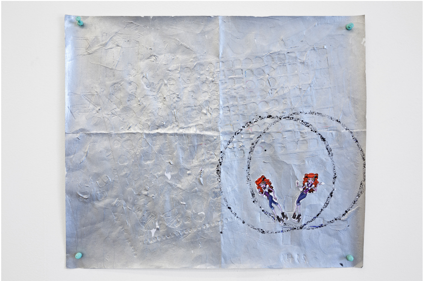
Paul Pascal Theriault Double Operetta , 2016

Pen, ink, acrylic, gel medium, Monsters High stickers, sticker backing, glitter nail polish on paper, painted push pins 14 X 16.5 in.