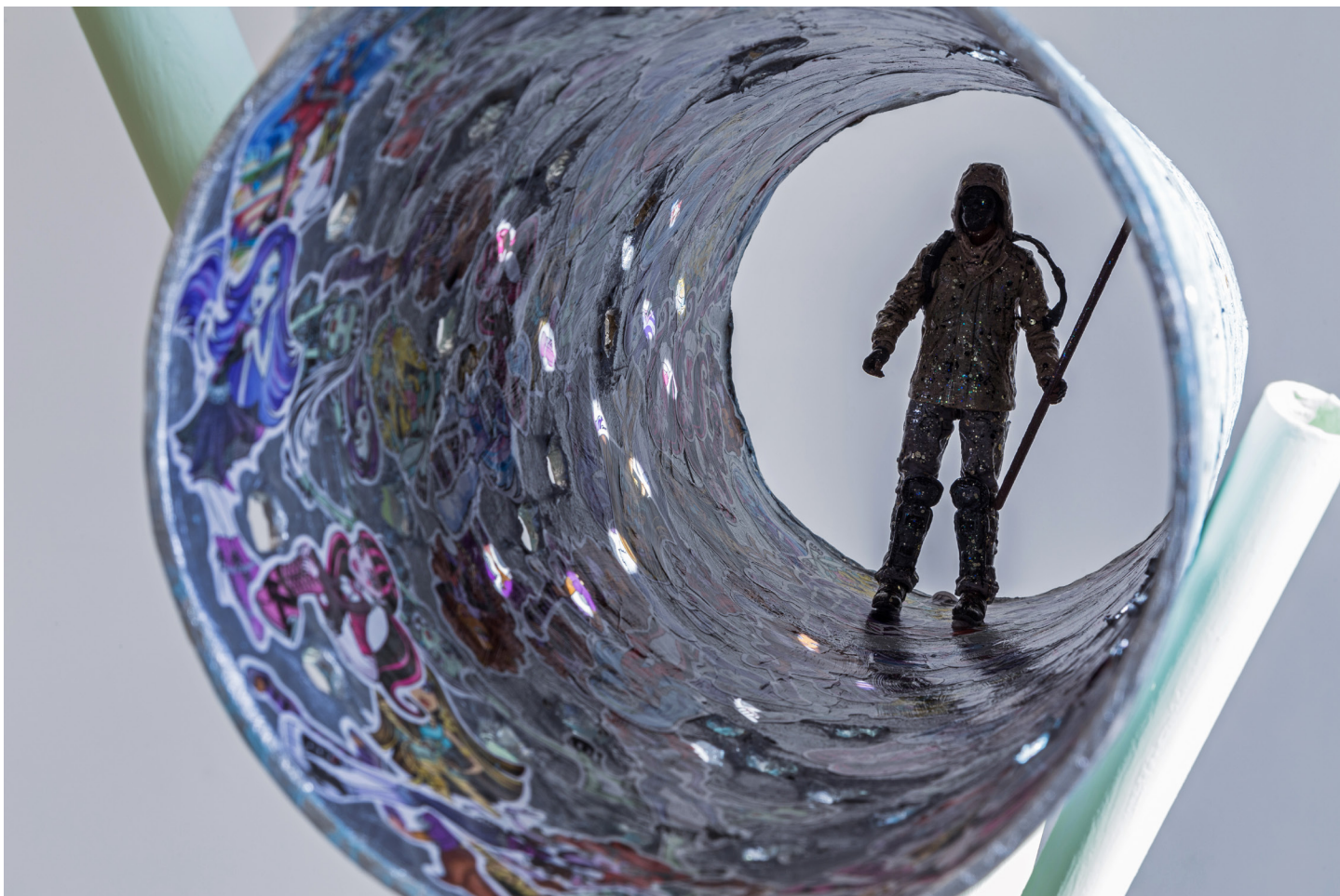
Paul Pascal Theriault Capricorn , detail