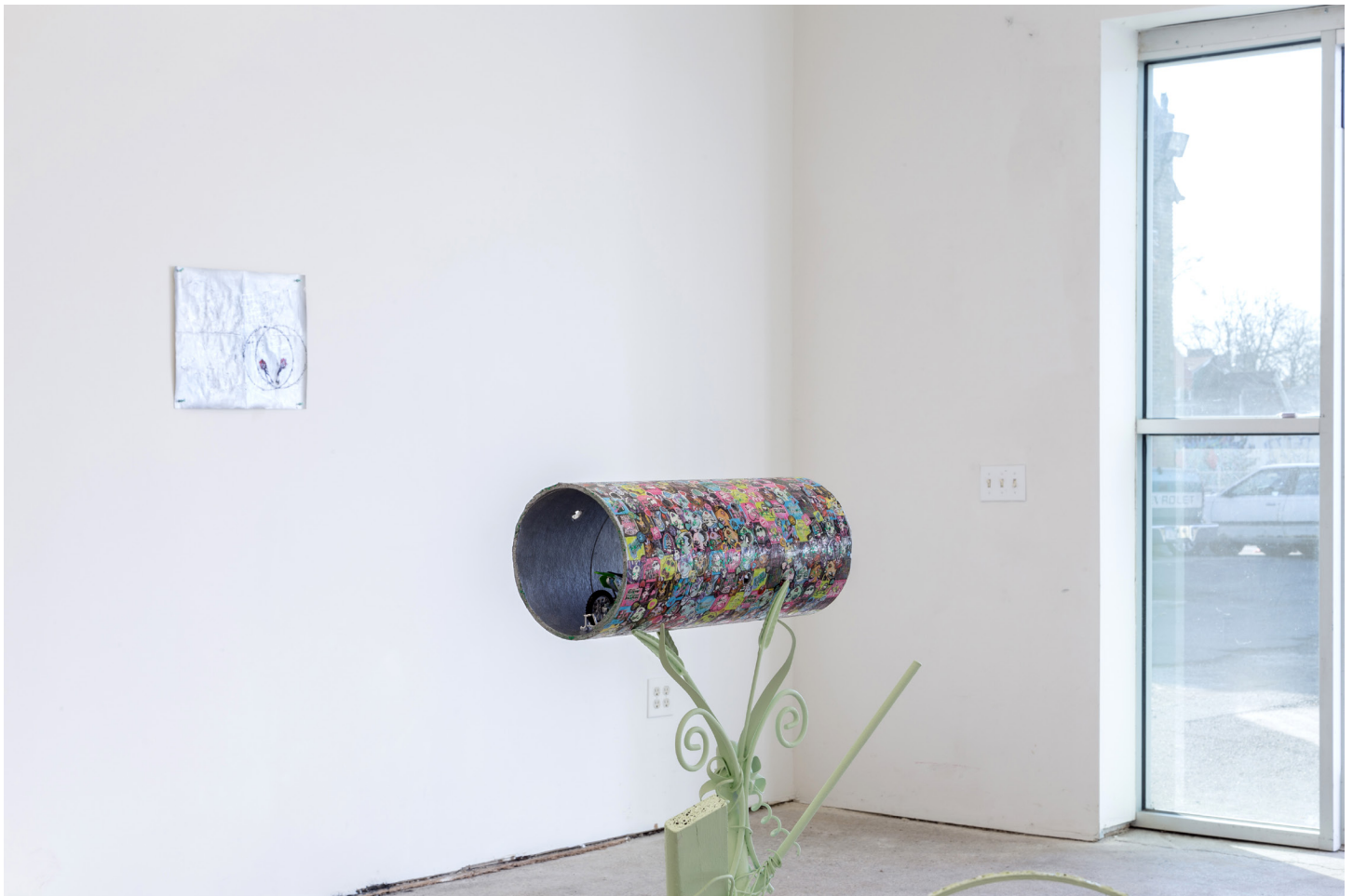
Paul Pascal Theriault Suns Tunnels Installation view