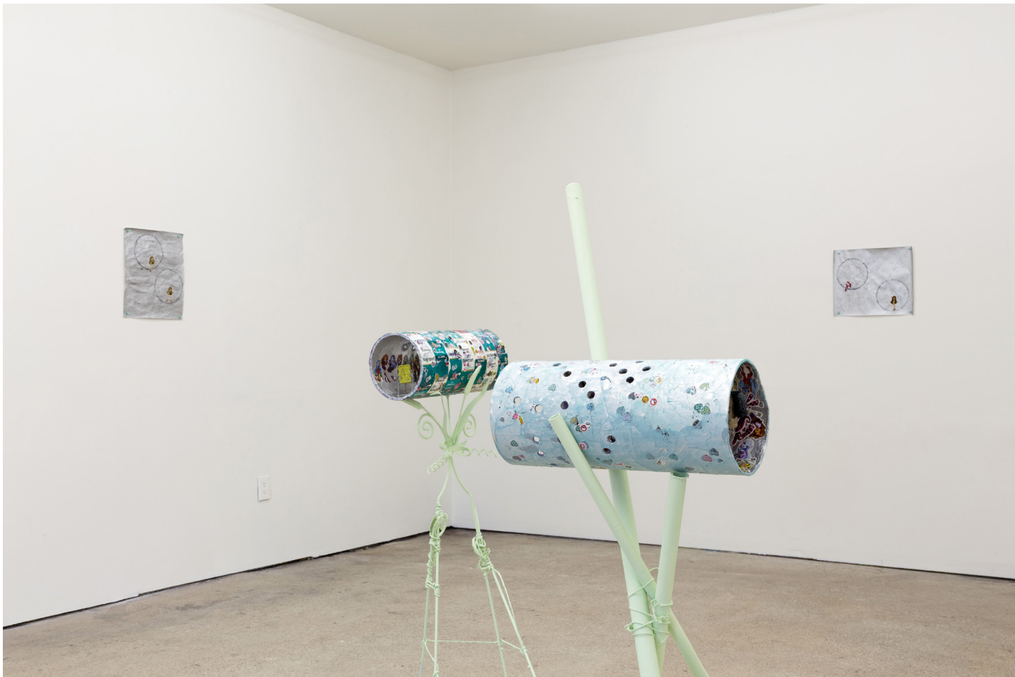
Paul Pascal Theriault Suns Tunnels Installation view