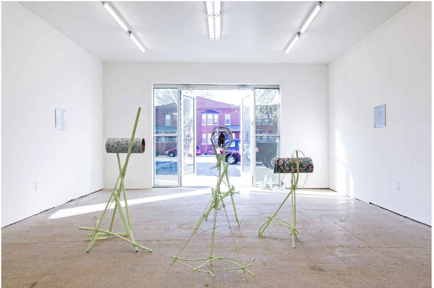
Paul Pascal Theriault Suns Tunnels Installation view