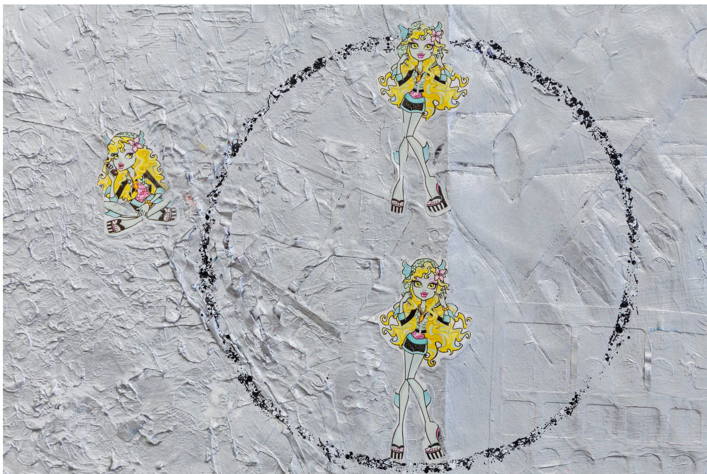
Paul Pascal Theriault Triple Lagoon Blue , detail