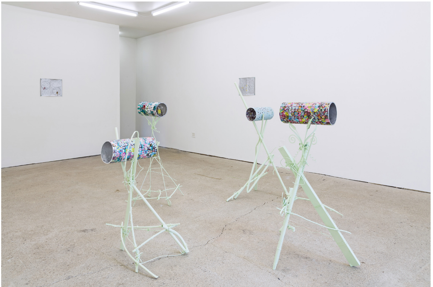
Paul Pascal Theriault Suns Tunnels Installation view