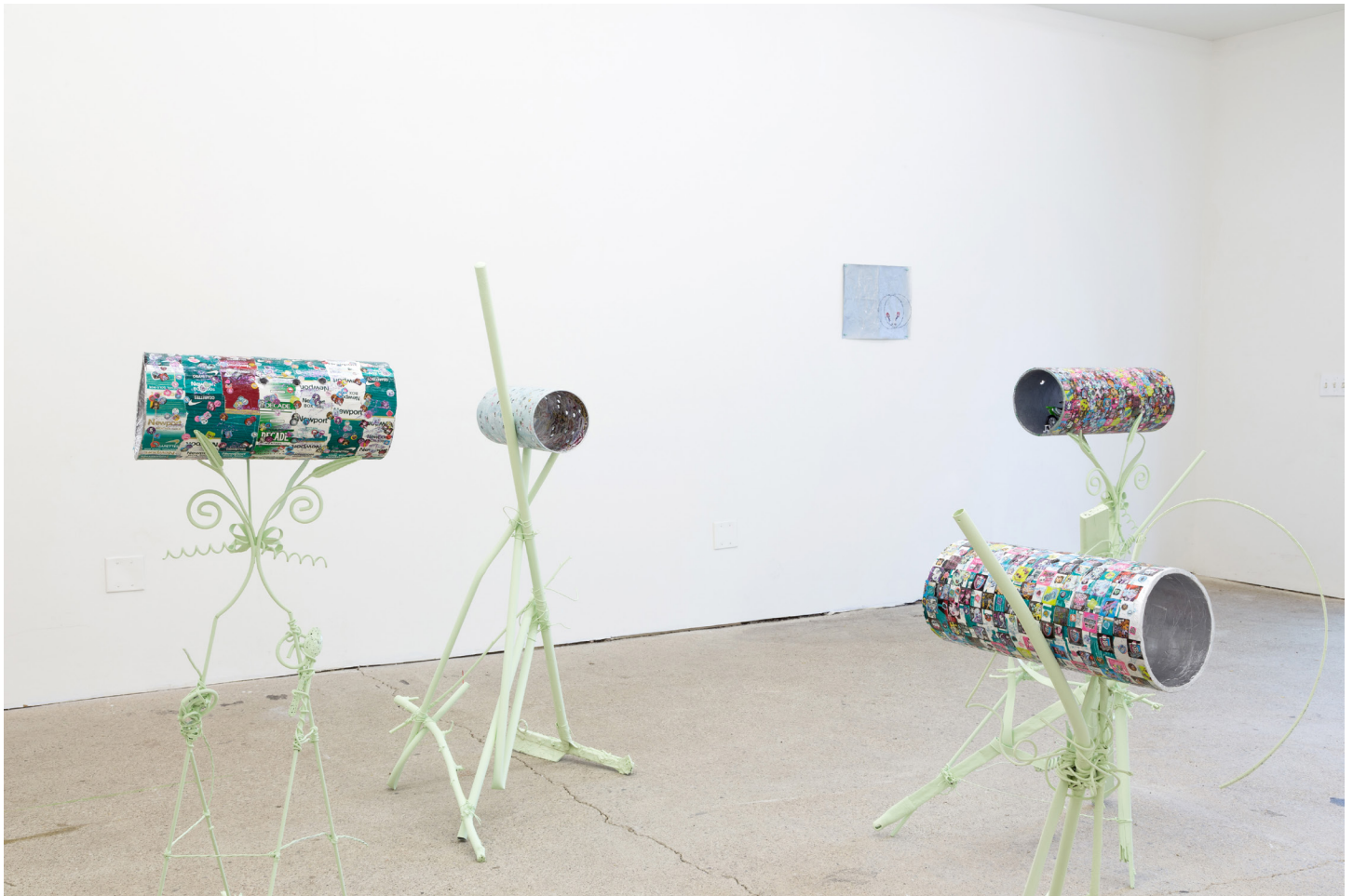
Paul Pascal Theriault Suns Tunnels Installation view