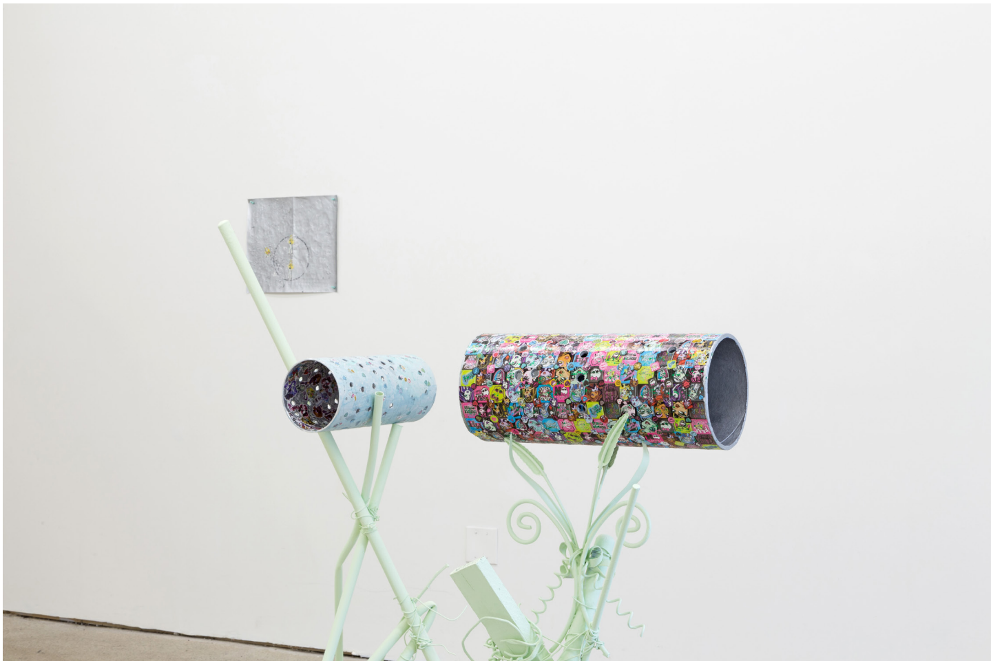
Paul Pascal Theriault Suns Tunnels Installation view