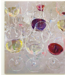
Nolan Simon Still Life After Dinner, 2017 Oil on linen 44 x 40 in. / 112 x 102 cm