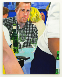
Nolan Simon Jake, Kunsthalle in June, 2017 Oil on linen 48 x 38 in. / 122 x 97 cm