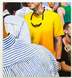
Nolan Simon Essex Flowers, Summer Opening, 2017 Oil on linen 44 x 40 in. / 112 x 102 cm