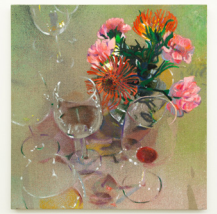
Nolan Simon Still Life with Centerpiece, 2017 Oil on linen 22 x 21 in. / 56 x 53 cm