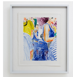
Nolan Simon Essex Flowers, Summer Opening, 2017 Ink monoprint on paper 13 x 10 3/8 in. unframed 16.5 x 14 in. framed 33 x 26 cm unframed 42 x 36 cm framed