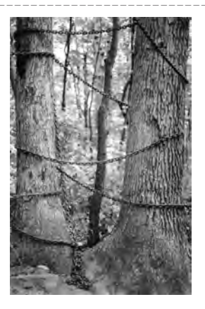
Cecilia Vicuña, Quipu Austral , 2012/2013 Installation, sound. Exhibition views Les Immémoriales , Frac Lorraine. Photos: Eric Chenal © The artist