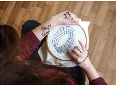
Fire of emotion - Genesis. Pamina de Coulon

By appointment every 30 minutes. Registration required, subject to availability: info@fracloirraine.org