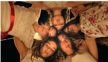
Mustang (extrait)