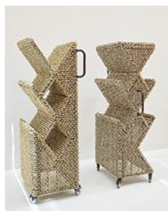
Haegue Yang Sonic Clotheshorse – Dressage #3 , 2019, and Sonic Clotheshorse – Dressage #4 , 2019