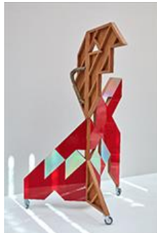
Haegue Yang Reflected Red-Blue Cubist Dancing Mask , 2018

Wood, stainless steel, handles, casters, and self-adhesive diamond reflective and holographic vinyl film 186 x 118 x 107 cm