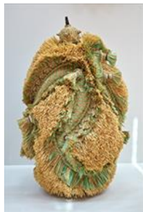
Haegue Yang The Intermediate – Dragon Conglomerate , 2016