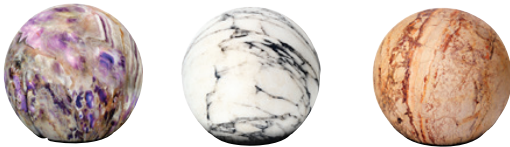
Maurizio Galante & Tal Lancman, Stool/Tattoo Stone 2011, diameter: 45 cm, ovoid with polyurethane rigid support structure and internal plastic base covered with a technical printed fabric.