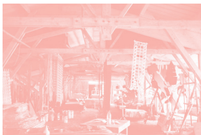
Julien Carreyn Val de Loire Treillages 2014, pigmen print on Hahnemüle paper, edition 1/4 (+1 AP)

There is nothing personal of yours to exhibit May 23 - July 19