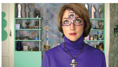
Shana Moulton, The Undiscovered Drawer 2013, video, 9'50" édition 2/3 (+ 2 AP)