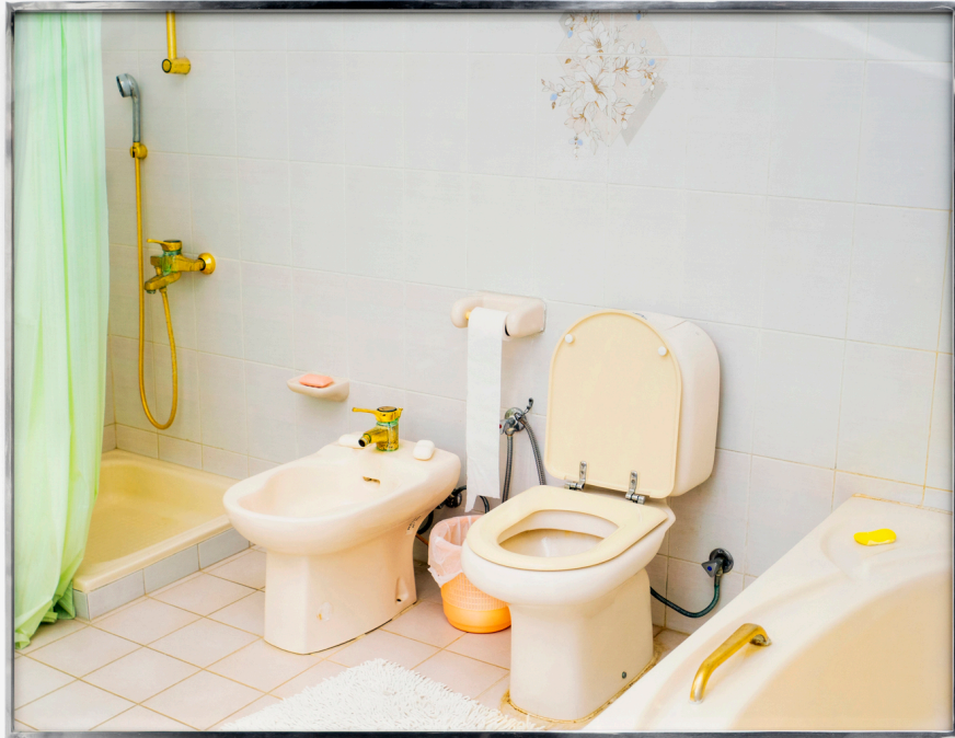
Farah Al Qasimi Beige Bathroom , 2020 Edition 1 of 5 + 2 AP Archival Inkjet Print 27 x 35 in (68.6 x 88.9 cm) F.AIQasimi0005