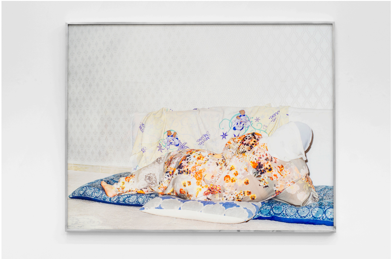
Farah Al Qasimi A Reclining , 2020 Edition 1 of 5 + 2 Archival Inkjet Print 31 x 40 in (78.7 x 101.6 cm) F.AIQasimi0002