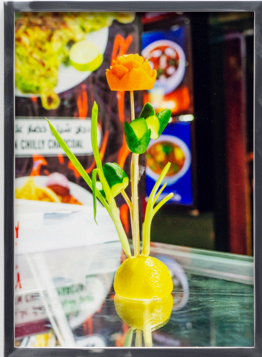
Farah Al Qasimi Carrot Rose , 2020 Edition 1 of 5 + 2 Archival Inkjet Print 11 x 8 in (27.9 x 20.3 cm) F.AIQasimi0004