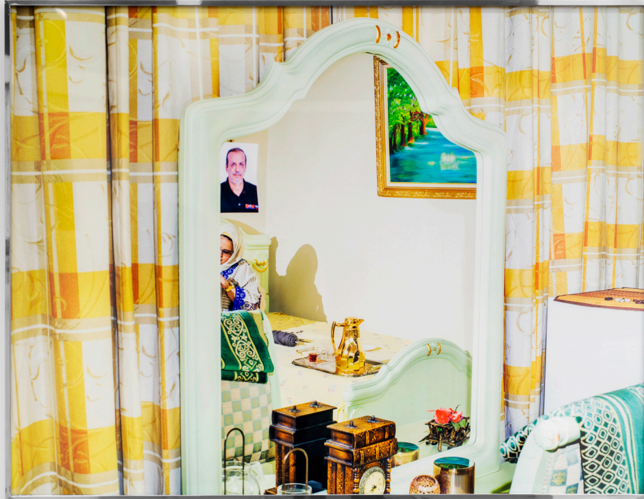
Farah Al Qasimi Anood in the Guest Bedroom , 2020 Edition 1 of 5 + 2 Archival Inkjet Print 31 x 40 in (78.7 x 101.6 cm) F.AIQasimi0003