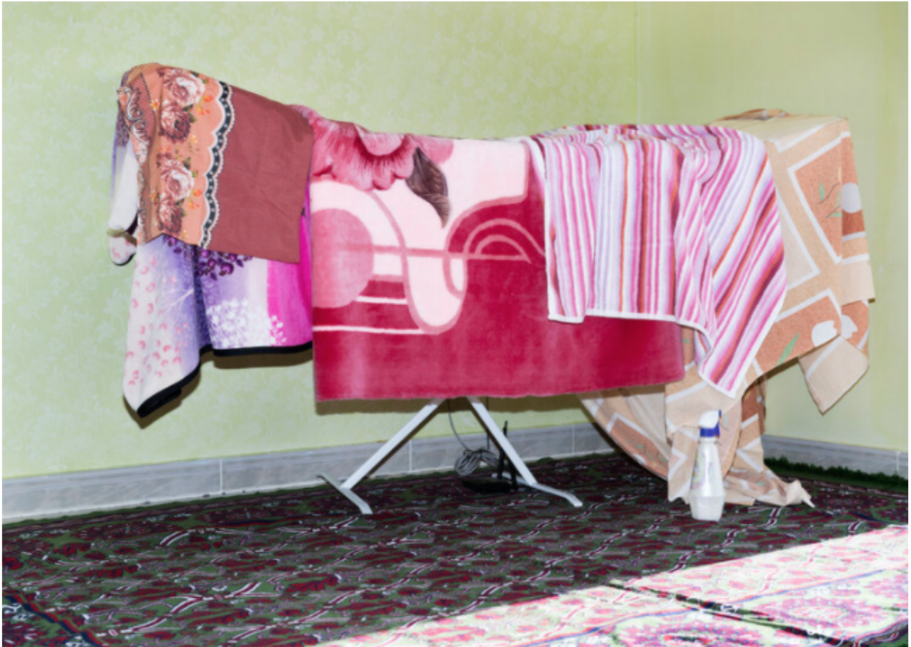
Farah Al Qasimi Drying Rack , 2018 Edition 1 of 5 + 2 Archival Inkjet Print 18 x 25 in (45.7 x 63.5 cm) F.AIQasimi0007