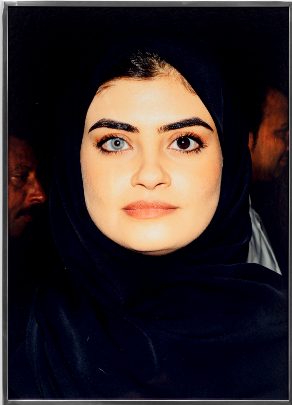
Farah Al Qasimi May's Blue Eye , 2020 Edition 4 of 5 + 2 Archival Inkjet Print 25 x 18 in (63.5 x 45.7 cm) F.AIQasimi0001