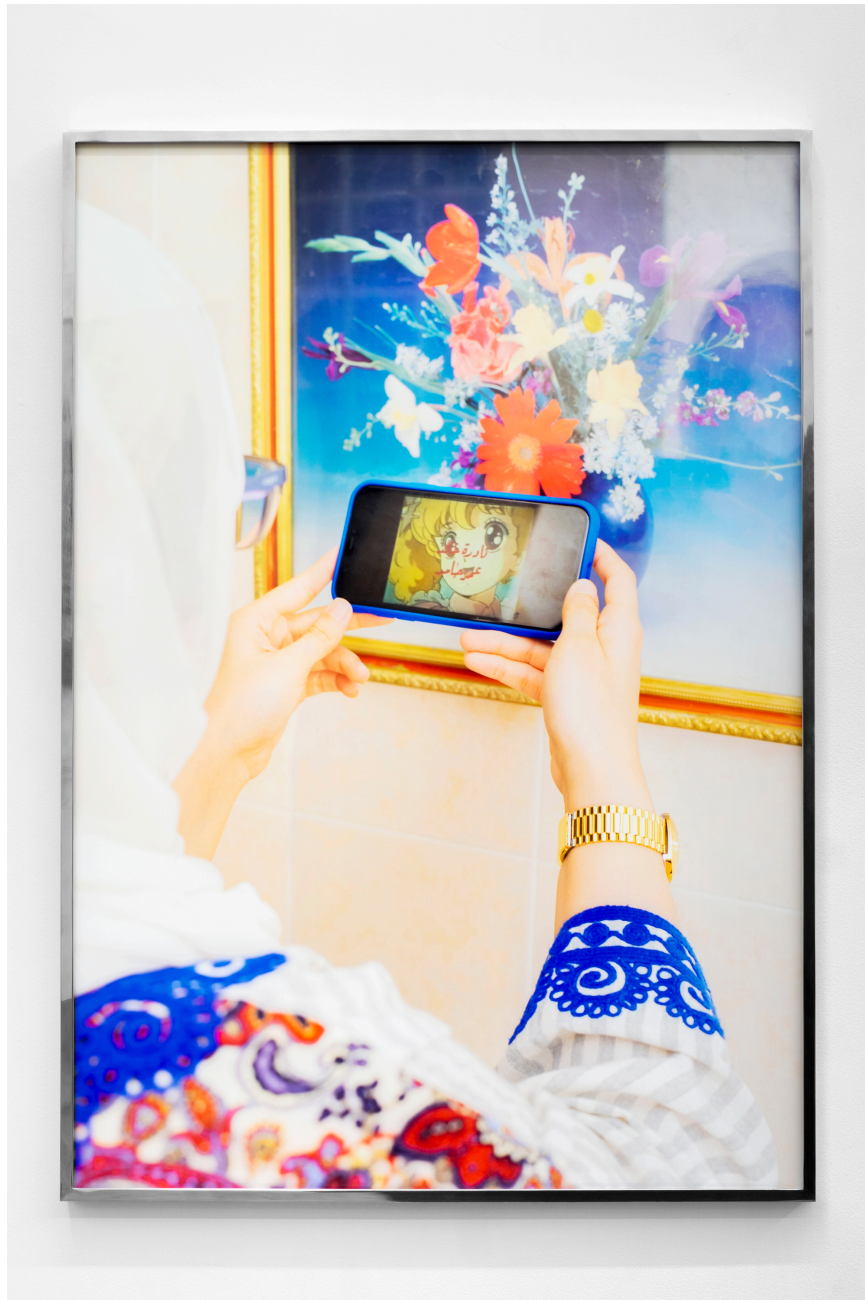
Farah Al Qasimi Lady Lady , 2019 Edition 1 of 5 + 2 Archival Inkjet Print 30 x 21 in (76.2 x 53.3 cm) F.AIQasimi0009