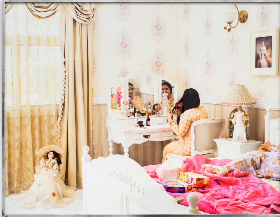
Farah Al Qasimi Noora's Room , 2020 Edition 1 of 5 + 2 Archival Inkjet Print 27 x 35 in (68.6 x 88.9 cm) F.AIQasimi0010