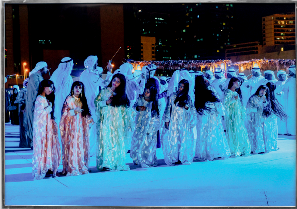
Farah Al Qasimi Khaleej Hair Dance , 2020 Edition 1 of 5 + 2 Archival Inkjet Print 21 x 30 in (53.3 x 76.2 cm) F.AIQasimi0008