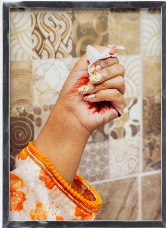
Farah Al Qasimi Bloody Palm , 2019 Edition 2 of 5 + 2 Archival Inkjet Print 11 x 8 in (27.9 x 20.3 cm) F.AIQasimi0006