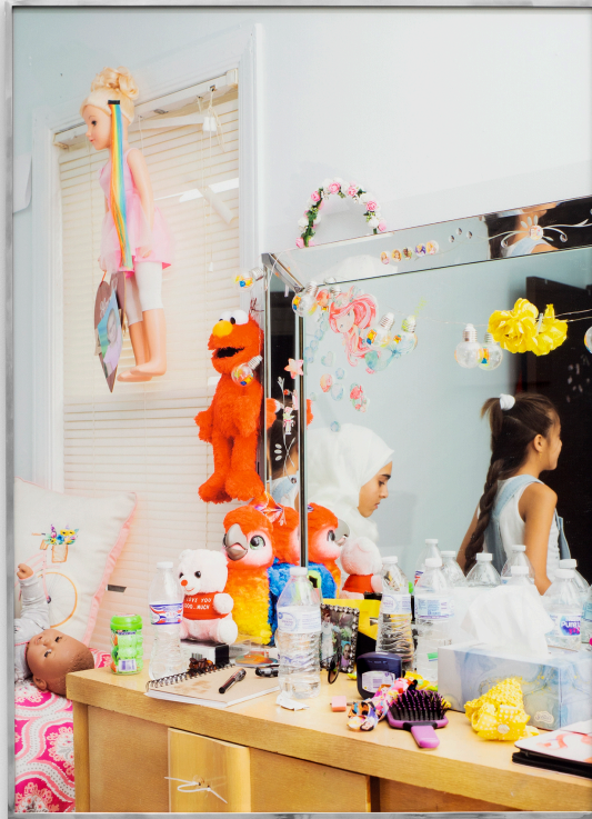
Farah Al Qasimi Marwa Braiding Marah's Hair , 2019 Edition 3 of 5 + 2 AP Archival Inkjet Print 40 x 29 in (101.6 x 73.7 cm) F.AIQasimi0011