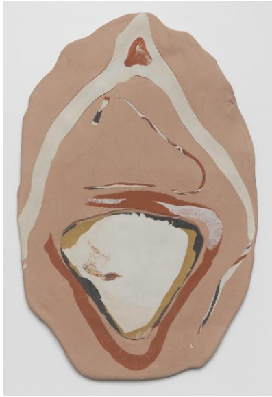
「粘土絵 4」 "Modeling Picture 4", 2016 Clay 38.2 x 28 cm