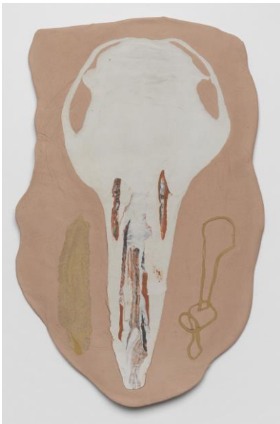
「粘土絵 5」 "Modeling Picture 5", 2016 Clay 37 x 23.5 cm