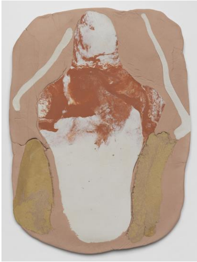
「粘土絵 1」 “Modeling Picture 1”, 2016 Clay 42.5 x 25.5 cm