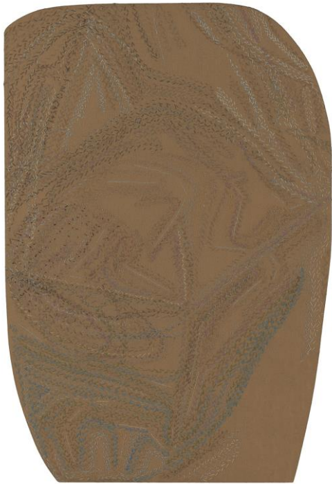
「山は囲われ出にくい」 “The Mountain is Enclosed and It's Hard to Leave” 2016 Embroidery on fabric 125 x 85 cm