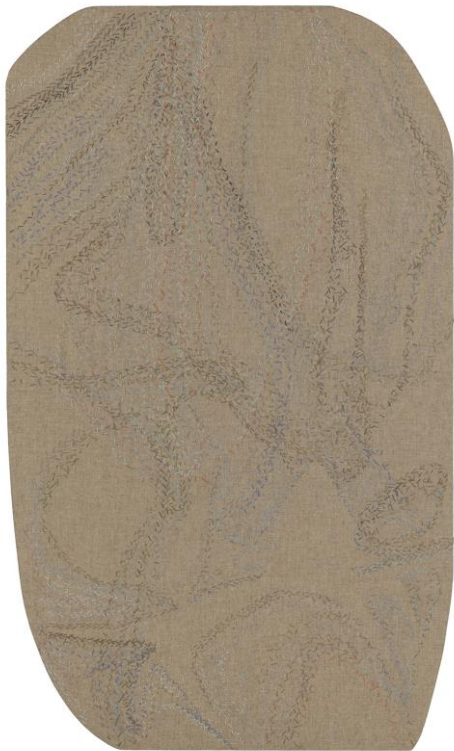
「脱けると天地がさかさになる」 “In Passing, Everything Turns Upside Down”, 2016 Embroidery on fabric 136 x 81 cm