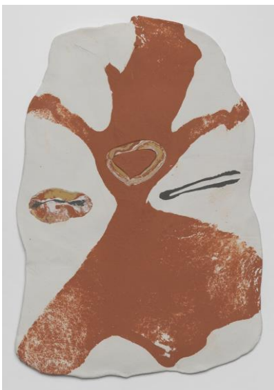
「粘土絵 6」 "Modeling Painting 6", 2016 Clay 40 x 27 cm