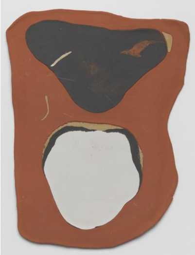
「粘土絵 2」 “Modeling Picture 2”, 2016 Clay 40.5 x 30 cm