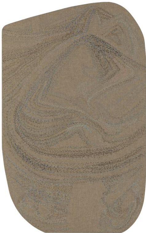
「一つの小さな骨を起点にできた山」 “A Mountain that Originated from One Small Bone” 2016 Embroidery on fabric 128.1 x 80 cm