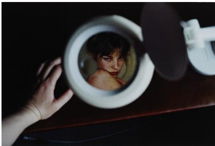
Erika Yoshino "Untitled", 2013 C-print Image size: 20 x 30 cm Paper size: 27.9 x 35.6 cm

Gallery hours: 11:00-19:00 Closed on Sun, Mon and National holidays