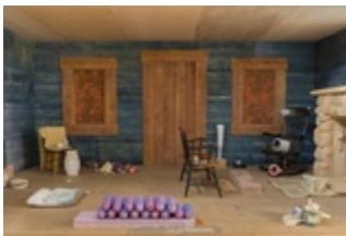
Kaari Upson TK dollhouse VIDEOS [THERE IS NO SUCH THING AS OUTSIDE (Doll House) (home / home')] , 2017 – 2019 Video with sound variable Inv# 00000615