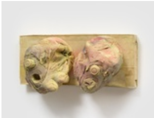
Kaari Upson Toxic Titties , 2017 urethane, pigment, and aluminum 20 x 42 x 22 in. Inv# 00000598