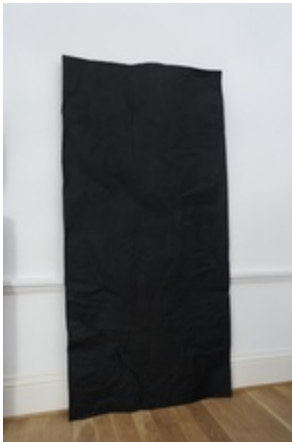
Kaari Upson Charcoal Panel 010 (Drag 3) , 2012 charcoal and aqua-resin 87.25 x 47 x 4 in / 221.6 x 119.4 x 10.2 cm Inv# KU284