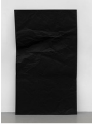
Kaari Upson Charcoal Panel 006 (Weight) , 2012 charcoal and aqua-resin 80 x 47 5/8 x 4 in / 203.2 x 121 x 10.2 cm Inv# KU282