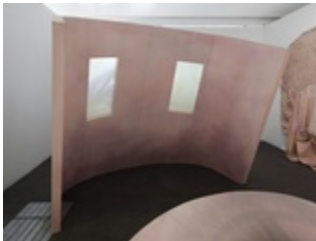
Kaari Upson Untitled (wall/video) , 2011 Single channel video and mixed media 107 x 121 x 88 inches / 271.8 x 309.2 x 223.5 cm Inv# KU201