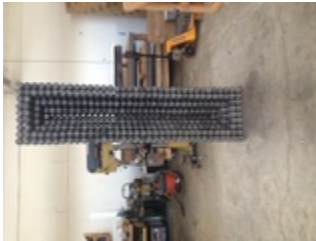
Kaari Upson MMDP III (Vertical Slit) , 2015 – 2016 Aluminum and steel 24 x 19 x 94 in. Inv# 00000438