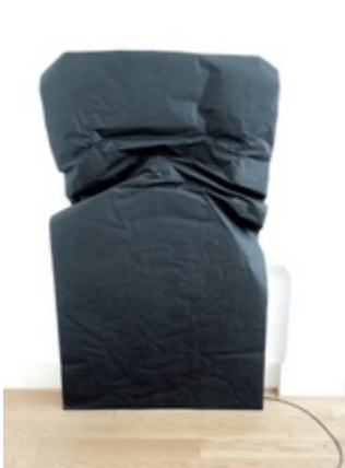
Kaari Upson Charcoal Panel 014 (Position 1) , 2012 charcoal and aqua-resin 78.75 x 48 x 7.5 in / 200 x 121.9 x 19.1 cm Inv# KU286