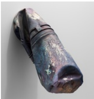
Kaari Upson Silicone Leftover (5 gal), 2015 urethane, acrylic pigment, spray paint, aluminum 25,5 x 9,5 x 12 inch Inv# 00000541