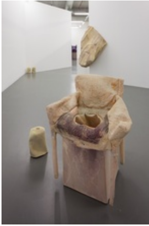
Kaari Upson Him/Him , 2017 urethane, pigment, and aluminum 34 x 30 x 25 in. Inv# 00000570