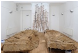
Kaari Upson Mirrored Staircase Inversion (San Bernardino) , 2012 stabilized acrylic, sand, polyurethane foam with steel and aluminum frame, Vicks vaporizers 30 x 162 x 55 in / 76.2 x 411.5 x 139.7 cm and 28 x 158 x 67 in / 71.1 x 401.3 x 170.2 cm Inv# 00000264