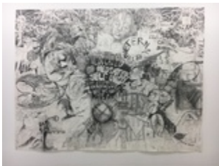
Kaari Upson eternal return , 2015 – 2018 Graphite on paper 98.5 x 130 in. Inv# 00000480