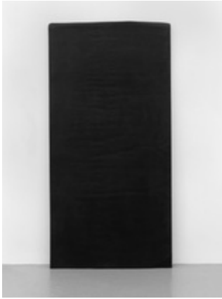
Kaari Upson Charcoal Panel 016 (Untouched) , 2012 charcoal and aqua-resin 245.1 x 121.9 x 4.4 cm Inv# KU 290