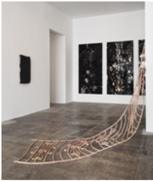
Kaari Upson Balcony, 2011 Latex and acrylic paint 142 1/2 x 39 in. Inv# KU233