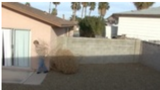
Kaari Upson In Search of the Perfect Double, 2016 video 36:18 minutes None of 3 plus None of 2 AP Inv# 00000534