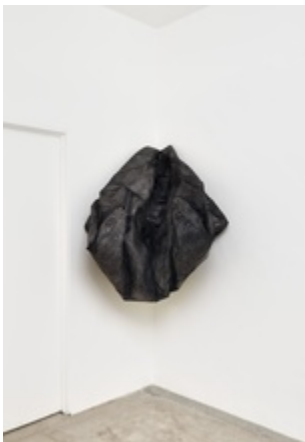
Kaari Upson habit 1 , 2017 Urethane, pigment, charcoal powder, and aluminum 48 x 62 x 42 in. Inv# 00000611