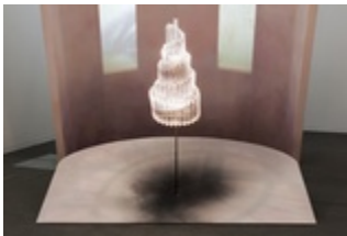
Kaari Upson Untitled (chanedelier/plinth) , 2011 Mixed media 69.5 x 97 x 60.75 inches / 176.5 x 246.4 x 154.3 cm Inv# KU200