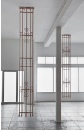
Kaari Upson Barrier Barrier , 2011 – 2018 Latex 141.5 x 24 x 2 in. Inv# 00000604