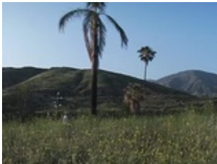
Kaari Upson There are things one can do to oneself (Super Moon) , 2012 video 0 of 3 Inv# 00000451