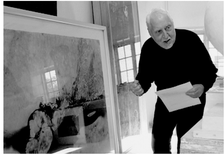
Stills from the film catalogue