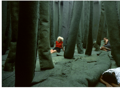
The Forest , 1998. Synthetic cloth, wood, paper ; Variable dimensions. MAMCO Collection, Geneva, Switzerland. © Veilhan / ADAGP, Paris, 2017.