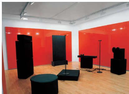
Untitled (Le Studio) , 1993 Installation view, Galleri Riis, Oslo. Wood, fabric, Bois, tissu, acrylic paint and cable ; variable dimensions. Collection Javier Lopez, Madrid.