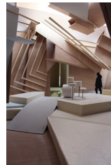
Studio Venezia Model (detail) © Veilhan / ADAGP, Paris, 2017