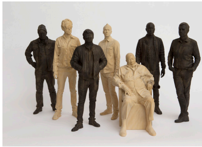
The Producers, 2015 (detail of The Producer's Cabinet). Ebony, boxwood. / From left to right : Chad Hugo (The Neptunes), Thomas Bangalter, Guy Manuel de Homem-Christo, Nigel Godrich, Quincy Jones, Pharrell Williams (The Neptunes), Philippe Zdar.