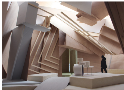
Studio Venezia Model (detail) © Veilhan / ADAGP, Paris, 2017