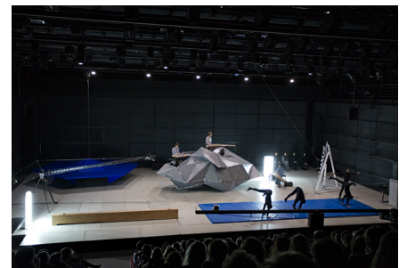
Aérolite , 2007. Performance conceived by Xavier Veilhan with Air. Centre Pompidou, Paris, 07/04/2007. © Veilhan/ADAGP, Paris, 2017.