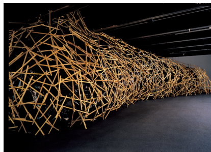
The Cave, 1998. Synthetic carpet, wood, PVC ; Variable dimensions. Collection F.R.A.C. Nord-Pas-de Calais, France. © Veilhan / ADAGP, Paris, 2017.