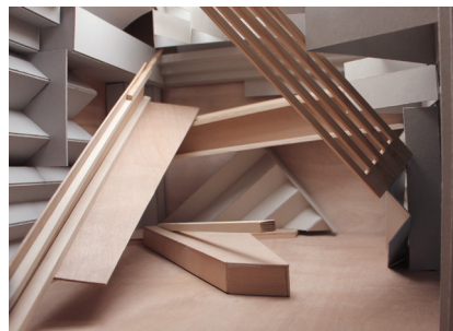
Studio Venezia Model (detail) © Veilhan / ADAGP, Paris, 2017