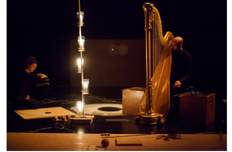
SYSTEMA OCCAM, Florence Gould Hall Theater, Fi:AF, New York, August 2013 Performance by Xavier Veilhan for OCCAM I, a musical piece by Eliane Radigue.