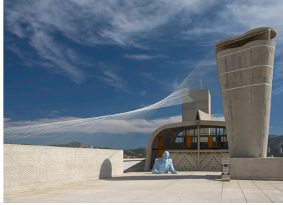
Exhibition view, Architectones , Unité d'habitation, Cité Radieuse, MAMO Audi Talents Awards, Marseille, 12/06-30/09/2013. Photo © Florian Kleinfenn ; © Veilhan © Fondation Le Corbusier / ADAGP, Paris, 2017. Works: Rays (Le Corbusier), 2013 / Le Corbusier (bust), 2013