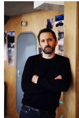
Portrait of Xavier Veilhan Photo © Diane Arques © Veilhan / ADAGP, 2017.