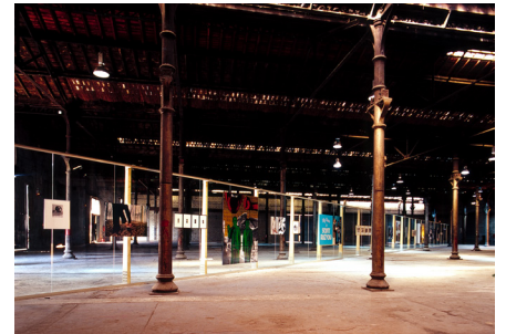
The Glass Wall , 2003. Wood, glass, metal ; 3,2 m x 62 m. Exhibition view, 05/06 – 12/10/2003. Device conceived for Faits et gestes , Atelier de mécanique, Parc des ateliers SNCF, Arles. Collection Fonds National d'Art Contemporain, Paris. © Veilhan / ADAGP, Paris, 2017.