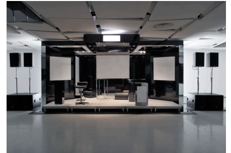
Exhibition, ON/OFF , Galerie des Galeries, Paris, 28/05-23/08/2014 © Veilhan / ADAGP, Paris, 2017.