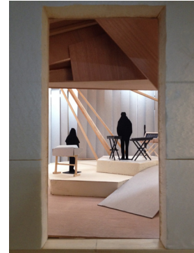
Studio Venezia Model (detail) © Veilhan / ADAGP, Paris, 2017