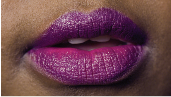
Candice Breitz, Sweat, 2018, courtesy KOW Berlin.