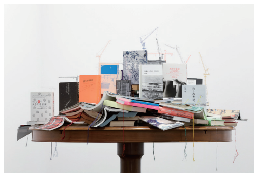
Tectonic Model (Flow), 2017