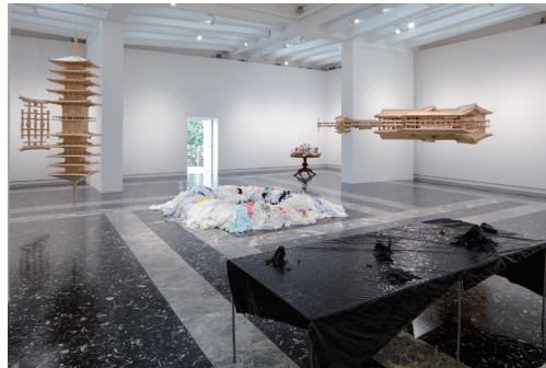
Installation image of "Turned Upside Down, It's a Forest"