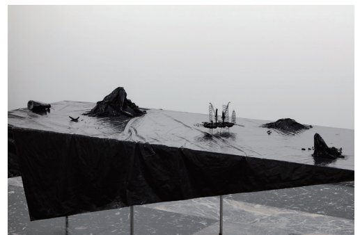
Out of Disorder (Offshore Model), 2017

all photos by Keizo Kioku photo courtesy of the Japan Foundation ©Takahiro Iwasaki, Courtesy of URANO