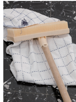
Out of Disorder (Turned Upside Down, It's a Forest), 2017