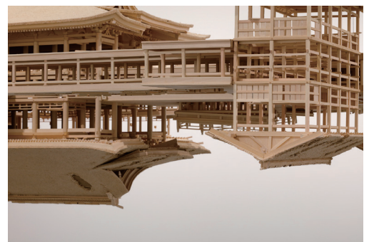
Out of Disorder (Ship of Theseus), 2017