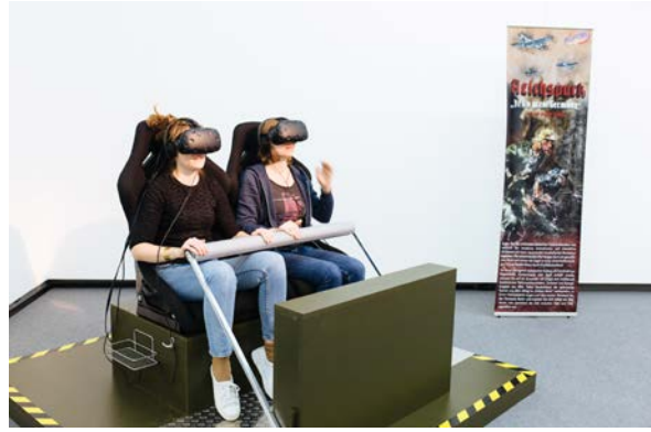
Jan Böhmermann and btf Deutschland, NRW Forum, Dusseldorf 2017/2018