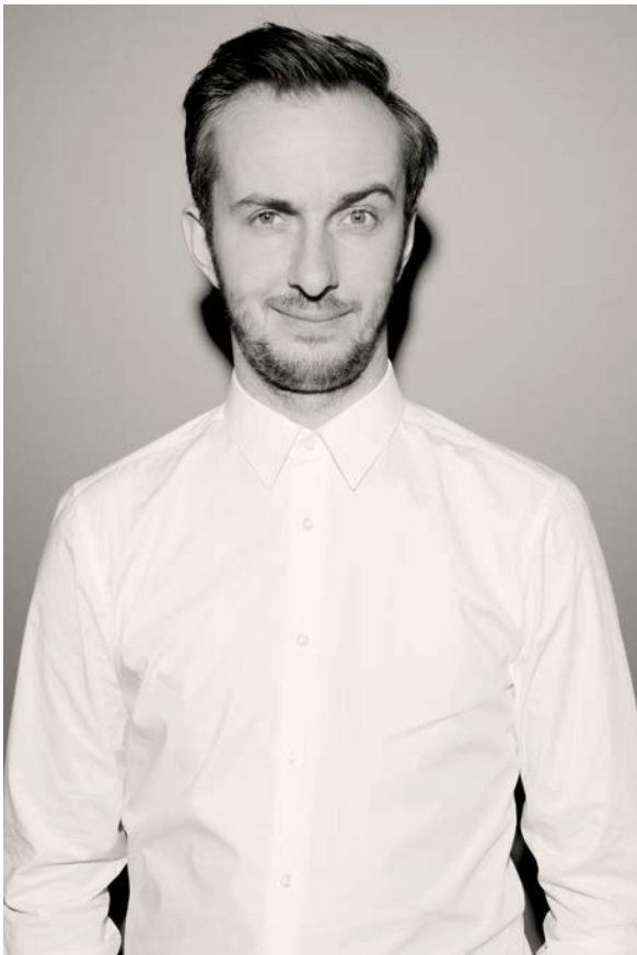
Jan Böhmermann