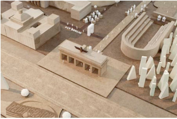
Jan Böhmermann and btf Deutschland, NRW Forum, Dusseldorf 2017/2018