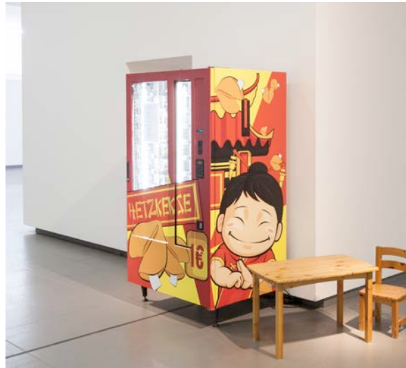
Jan Böhmermann and btf Deutschland, NRW Forum, Dusseldorf 2017/2018