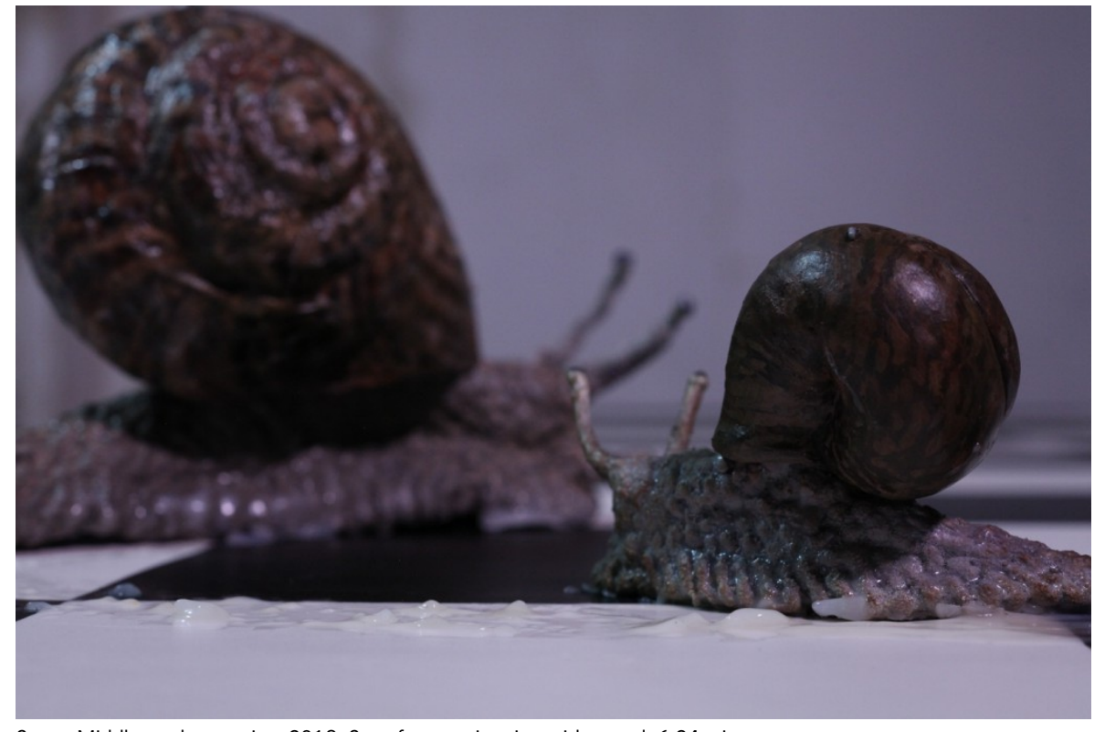
Stuart Middleton, keep going, 2018. Stop frame animation with sound, 6:24\ min.