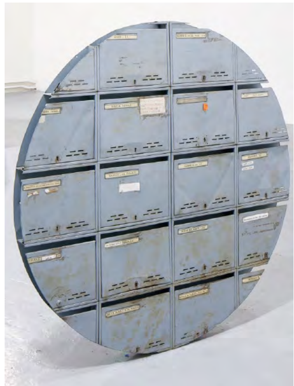
Little Warsaw, Armour, 2016, iron, 136,5 x 136,5 cm