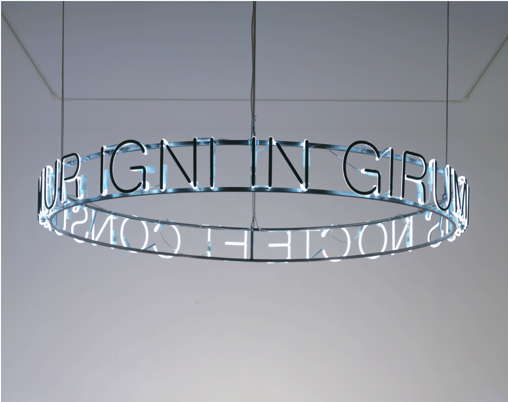
Cerith Wyn Evans, In girum imus nocte et consumimur igni , 2008, neon, metal, cable, plexiglass, 20 × 185 cm, courtesy the artist & Galerie Neu, Berlin