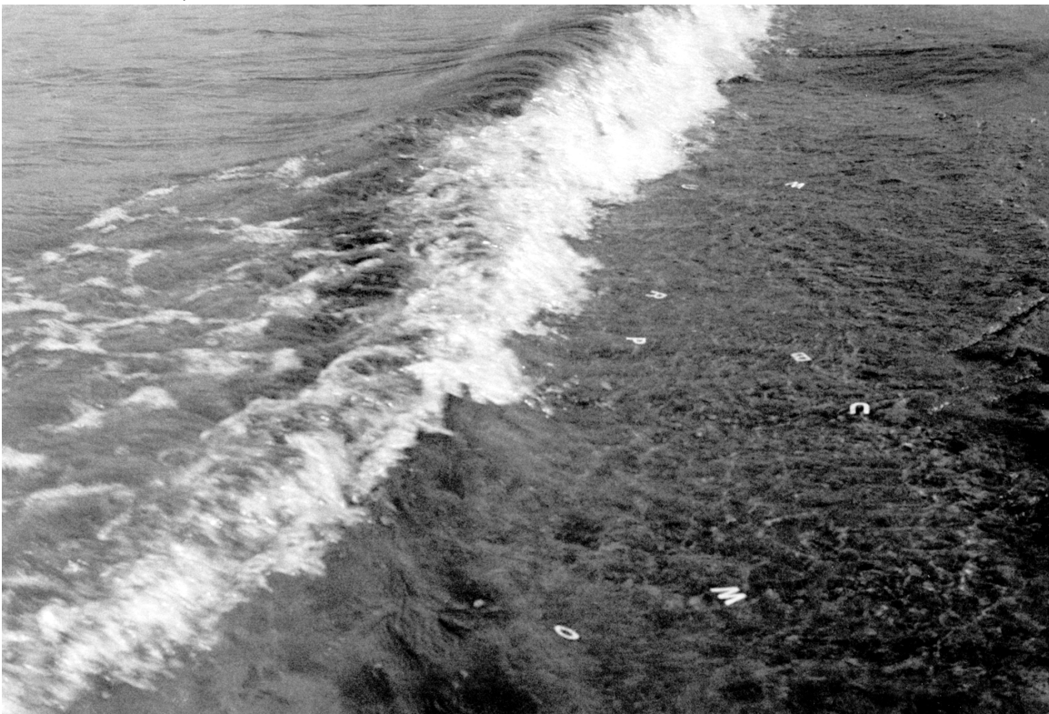
Ewa Partum, Active Poetry . 1971–1973, 8mm film transferred to DVD, b/w, 5:45 min, video still