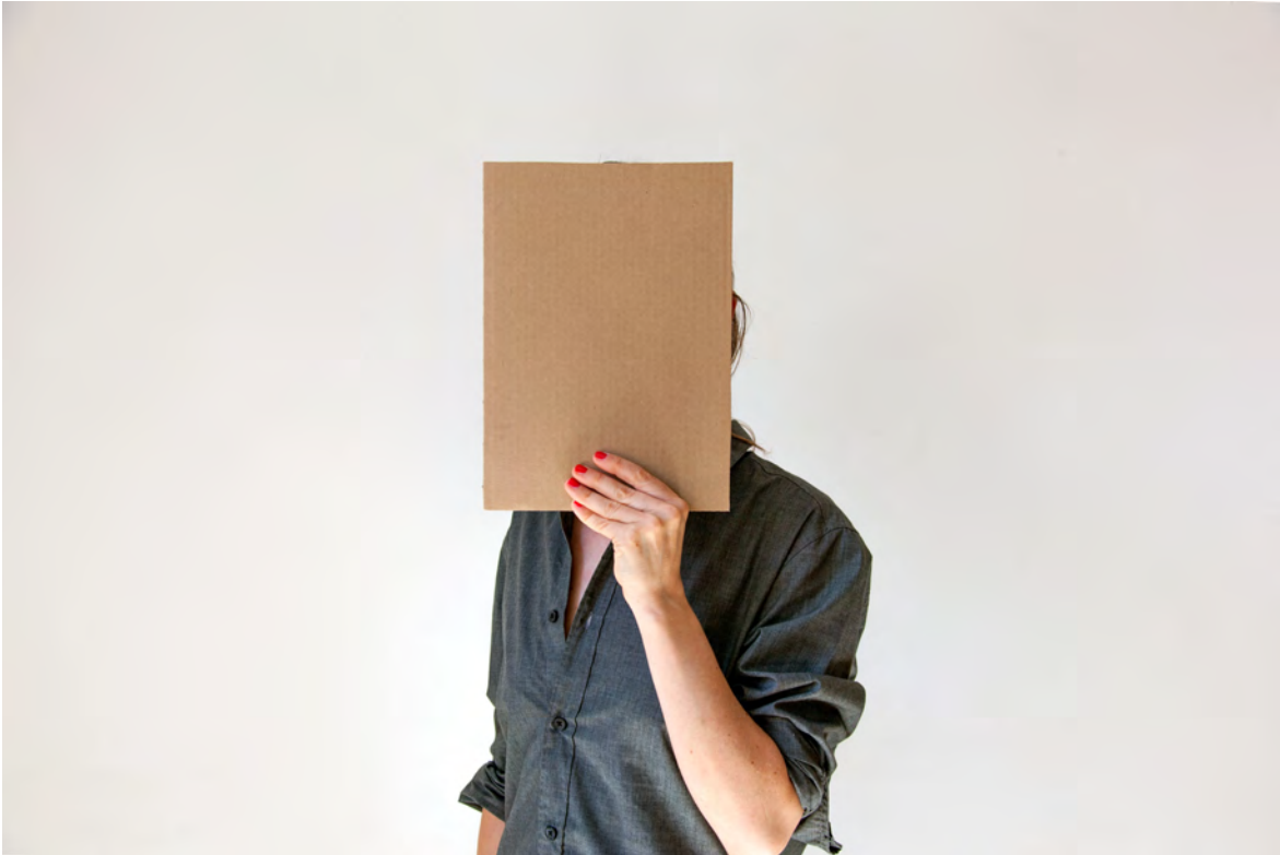
ekw14,90, Imperativ (l'individu dans l'image), 2016, HD video