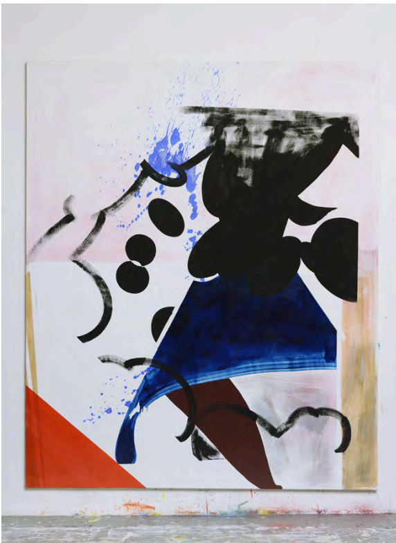
Doris Piwonka, o.T., 2013, oil on linen, 200 x 165 cm, Courtesy the artist, photo: I. Furcat