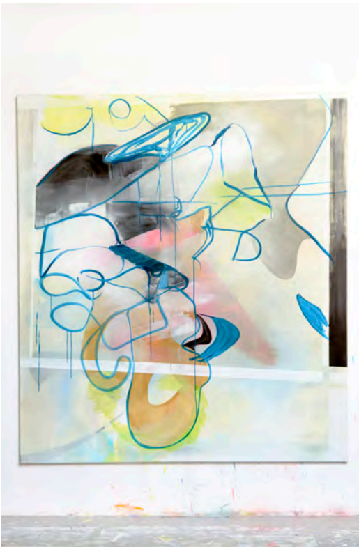
Doris Piwonka, o.T., 2012, oil on linen, 185 x 165 cm, Courtesy the artist, photo: I. Furcat