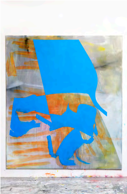
Doris Piwonka, o.T., 2013, oil on linen, 200 x 175 cm