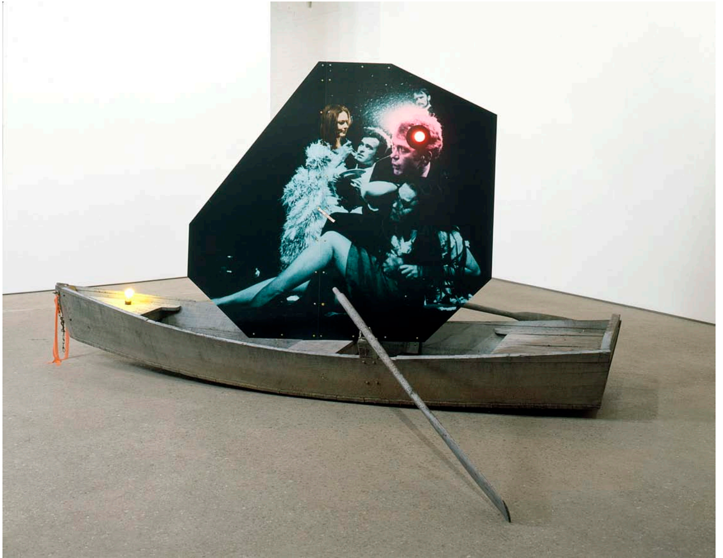
Lothar Hempel Endlose Reise (Endless Journey) 2006 Boat, MDF, photographic paper, lights 203.2 x 114.3 x 325.1 cm 80 x 45 x 128 ins (MA-HEMPL-00046)