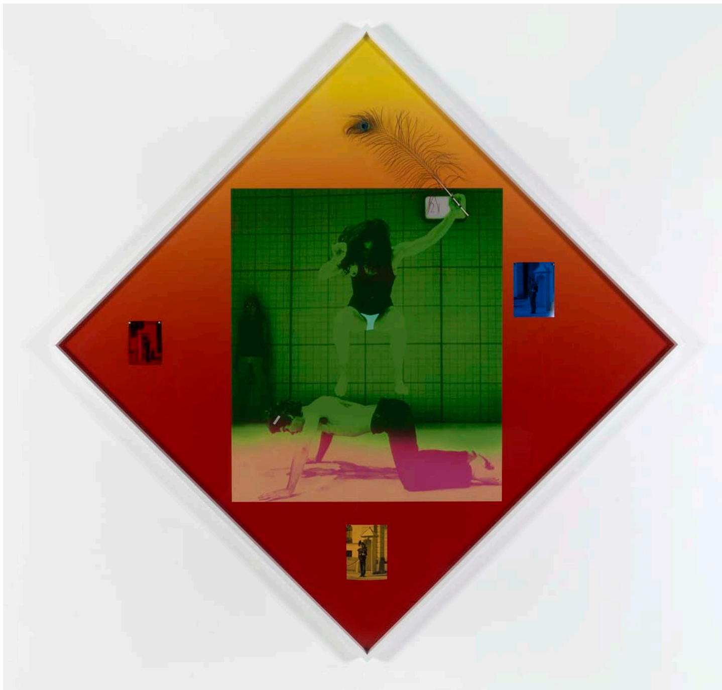
Lothar Hempel Plakat - wie im Zoo! 2009 c-print and mixed media on aluminium (framed) 254x254x5 cm, 100x100x2 ins (MA-HEMPL-00040)