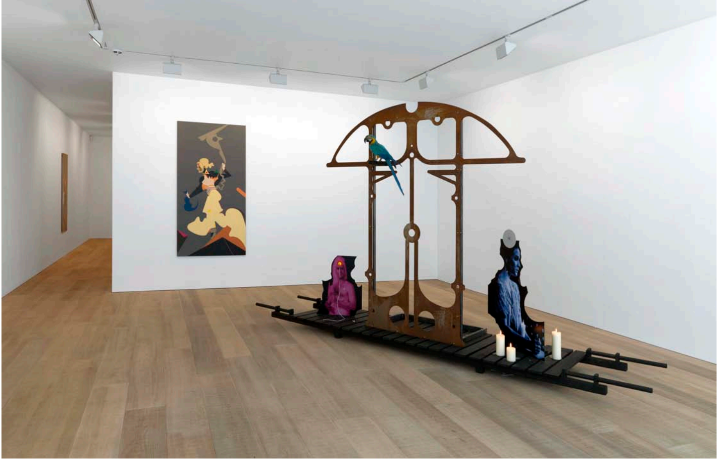
Lothar Hempel Installation view, Stuart Shave/Modern Art, 31 May – 29 June, 2008