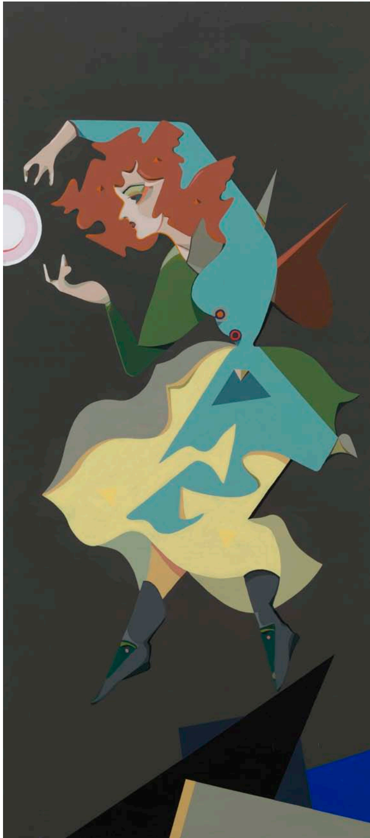
Lothar Hempel Die Muecke & Das Licht / The Mosquito and the Light 2008 acrylic on aluminium 90x40 cm, 35.4x15.7 ins (MA-HEMPL-00025)