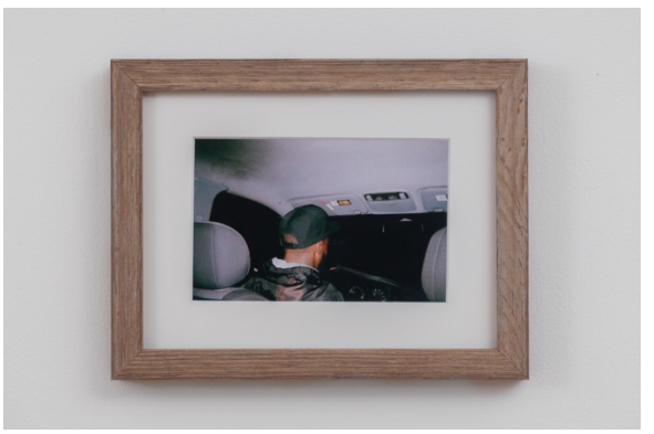
Behind Closed Doors, 2017 C Print 4 in x 6 in 1 of 1 (1 AP)