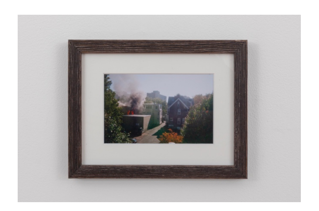
Yale, Your House is On Fire (A Sign) , 2017 C Print 4 in x 6 in 1 of 1 (1 AP)