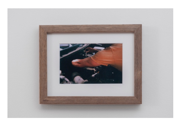
Hand in Hood, 2017 C Print 4 in x 6 in 1 of 1 (1 AP)