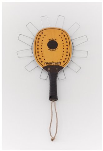
Black Beauty, 2020 Commanded Readymade 27 x 14 x 2.5 in