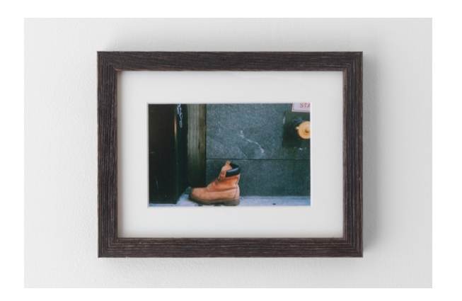
40 Below, 2017 C Print 4 in x 6 in 1 of 1 (1 AP)