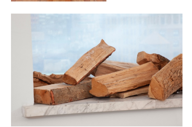
Window Pain, 2021

Reclaimed Antique Windows, Draped Blanket, BOSE Sound System, Healthcare, Crutches, Bandages, Old Stepping Ladder, Stone Adornments, Glass of Milk Dimensions Variable