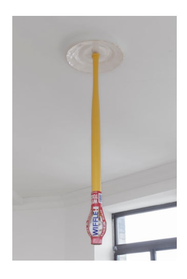
Home-Plate (Batman) , 2021 Wiffle Ball & Bat, Goop Dinner Plate 37 x 12 x 12 in