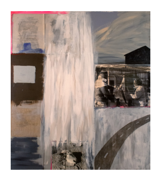
Assimilation #3, 2020 Acrylic, latex, ink, collage, graphite, and wax crayon on wood panel 48 x 42 inches