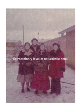
Collectibles #23, 2020 Archival giclée print 33 x 24 inches