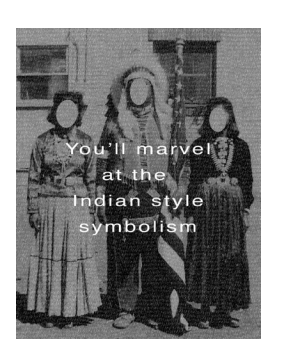
Collectibles #1, 2007 Archival giclée print 30 x 24 inches