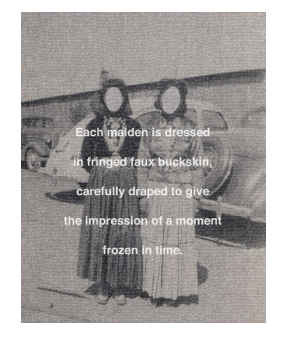
Collectibles #13, 2009 Archival giclée print 32 x 24 inches