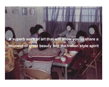
Collectibles #10, 2008 Archival giclée print 24 x 32 inches