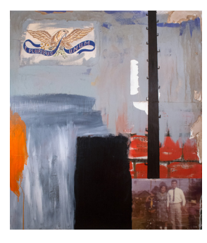
Assimilation #2, 2020 Acrylic, latex, graphite, needlepoint, and collage on wood panel 48 x 42 inches