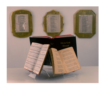
How I Learned To Be A Christ-jun, 2020 Installation consisting of 2 hymn books, a Navajo bible, 24 decoupaged hymns on goldpainted wooden plaques, and two-channel audio loop Dimensions variable