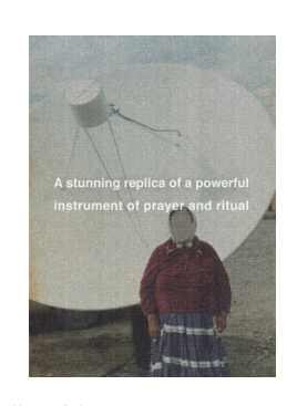
Collectibles #11, 2008 Archival giclée print 32.75 x 24 inches