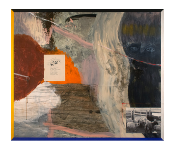
Land-Memory Improvisation #1, 2020 Acrylic, graphite, charcoal, ink, wax pencil, and collage on wood panel 41 x 48 inches