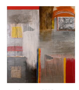
Assimilation #4, 2020 Acrylic, latex, ink, collage, graphite, and wax crayon on wood panel 48 x 42 inches