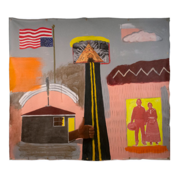
Living Beneath A White Rainbow, 2020 Acrylic, latex, ink, graphite, and collage on unstretched canvas 66 x 78 inches