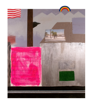
Assimilation #1, 2020 Acrylic, latex, collage, and artificial grass on wood panel 49.75 x 42 inches