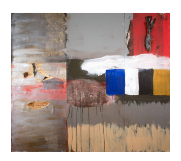
Land-Memory Improvisation #3, 2020 Acrylic, latex, graphite, medium, ink, bird wing, and collage on wood panel 42 x 48 inches