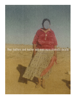
Collectibles #25, 2020 Archival giclée print 33.75 x 24 inches