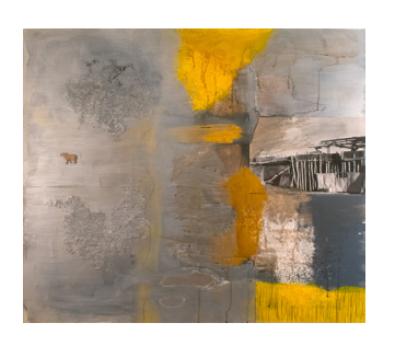
Land-Memory Improvisation #2, 2020 Acrylic, graphite, medium, ink, plastic, and collage on wood panel 41.5 x 48 inches