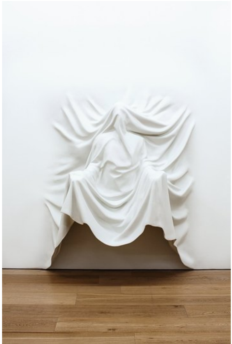
Daniel Arsham, Draped Figure with Arms Out , 2013.

Remember the Future will feature a mountain of almost 3,000 individual artifacts cast from 20th century media devices. Imagine thousands of telephones, film projectors, cameras, boomboxes and keyboards all cast in volcanic ash, bitumen, hydrostone and crystal. With these objects Arsham collapses time and transports the viewer to the surreal site of a future archaeological discovery, anticipating what landfills may be facing 100 years from now. Marrying theatre, architecture and science fiction, some of Daniel Arsham's best-known works break