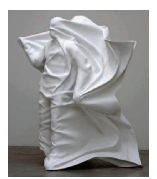
Above: Daniel Arsham, Hollow Figure , 2013. Courtesy of the Artist and Galerie Emmanuel Perrotin.