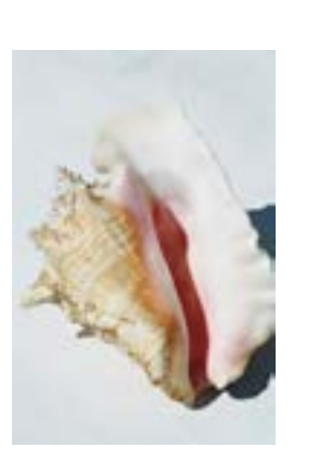
Conch Shell, 2015 Dye sublimation print on aluminum 49<sup>1</sup>/<sub>2</sub> x 33 inches Collection of Mansur Gavriel

UPS Sticker, 2000 C-print 38 x 30 inches Collection of Sara Meltzer