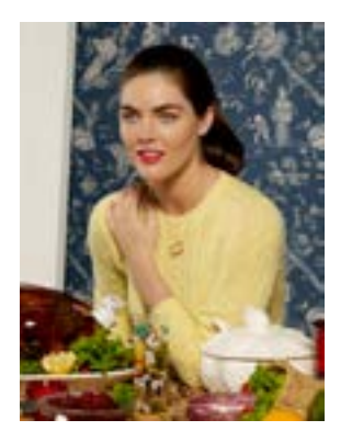
Thanksgiving 1984, 2009 C-print 44 x 34 inches

C-print 34½ x 35½ inches Anne & William J. Hokin Collection