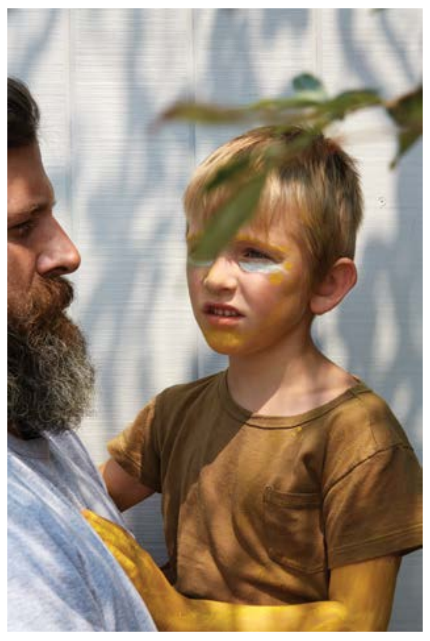
Roe Ethridge, Me and Auggie , 2015. Dye sublimation print on aluminum, 45 x 30 inches.