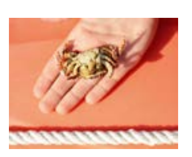
Auggie with Dead Crab, 2015 Dye sublimation print on aluminum 33 x 46<sup>13</sup>/<sub>16</sub> inches Collection of Nion McEvoy