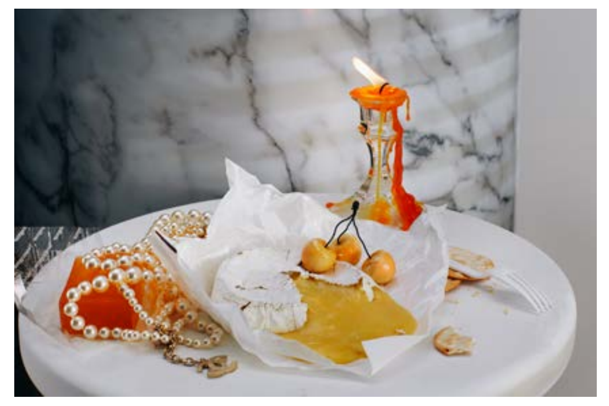
Roe Ethridge, Chanel Necklace for Gentlewoman, 2014. Dye sublimation print on aluminum, 34% x 51% inches.

Roe Ethridge: Nearest Neighbor is the artist's first solo museum exhibition in the United States and is accompanied by a new monograph titled Neighbors, published by Mack.