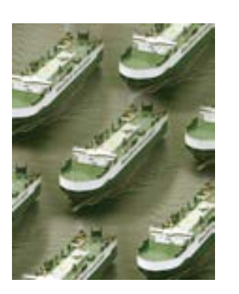
Car Carrier, New York Harbor, 2002 C-print 50 x 40 inches Collection of Beth Rudin DeWoody