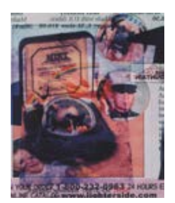
Lighter Side Co., 2004 C-print 33 x 27 inches