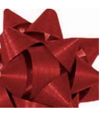
Bow, 2011 C-print 34½ x 34½ inches