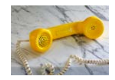
Yellow Phone, 2013 C-print 34<sup>3</sup>⁄<sub>4</sub> x 457⁄<sub>8</sub> inches Collection of Andrew Marks