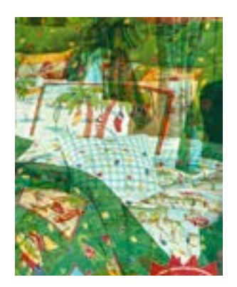
Domestications (Santa), 2004 C-print 33 x 27 inches Collection of Larry Gagosian