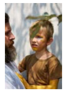
Me and Auggie, 2015 Dye sublimation print on aluminum 45 x 30 inches