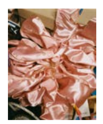
The Pink Bow, 2002 C-print 30 x 24 inches Courtesy of the Artist and Andrew Kreps Gallery, New York

Concrete Pour 7, 2007 C-print 40 x 51 inches Collection of Victor Pisante