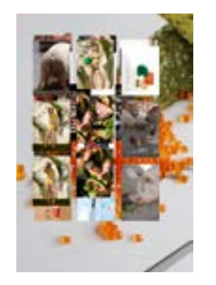
Model Prints and Pickles and Roe, 2014 Dye sublimation print on aluminum 49½ x 33 inches