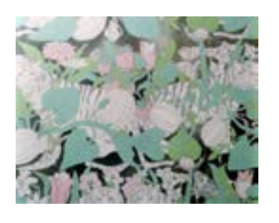
Hallway Wallpaper, 2003 C-print 40 x 50 inches Courtesy of the Artist and Andrew Kreps Gallery, New York

Nancy in Wellfleet, 2008 C-print 36 x 27½ inches Courtesy of the Artist and Andrew Kreps Gallery, New York