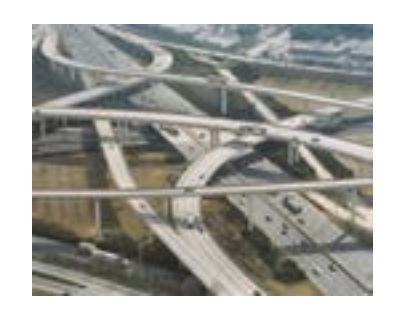
Junction, Atlanta, 2003 C-print 27 x 33 inches Collection of Larry Gagosian