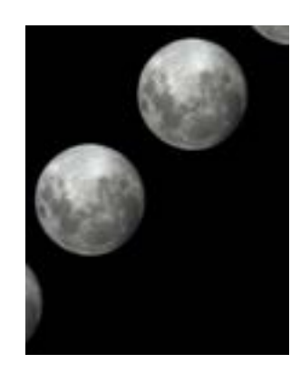
Moon, 2003 C-print 53 x 43 inches Collection of Larry Gagosian

Louise Blowing a Bubble, 2011 C-print 44 x 33 inches Private Collection, New York