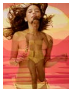
Double Teresa Oman, 2015 Dye sublimation print on aluminum 53 x 40 inches Collection of Brian Waterman and Lauren Lesser