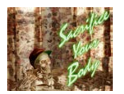
Sacrifice Your Body, 2013 C-print 41\% \times 51\% inches Private Collection

Jess Gold (Car Door), 2015 Dye sublimation print on aluminum 40 x 53 inches Collection of Peter Kahng, New York, NY