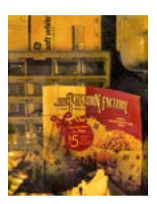
Popcorn Factory, 2005–2007 C-print (scanned from 4 x 5 polaroid) 30<sup>1</sup>/<sub>2</sub> x 24<sup>1</sup>/<sub>2</sub> inches