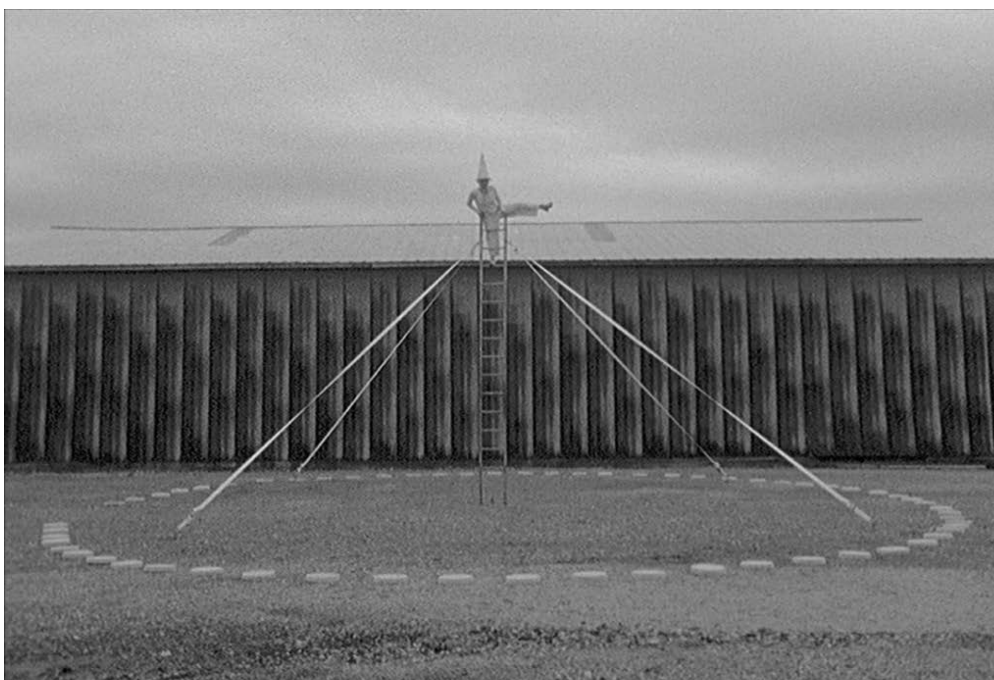
Alison Crocetta, A Circus of One , a 16mm black and white film in collaboration with composer Jason Treuting, 2011. Photo credit: 16m black and white film still

At the heart of this exhibition will be the premiere of A Circus of One (Act II) , a 30-minute event comprised of seven performance actions that occur within the intimate setting of a 20-foot-wide ring. For this project, she has joined forces with composer/musician Zac Little of the band Saintsenecca. Little's haunting and spacious music creates the soundscape for Crocetta's mesmerizing performance that runs the gamut from the absurd to the trance-inducing as she interacts with a large, shape-shifting wooden horse. In close proximity to this work, the CAC will present a large-scale projection of her 16mm black-and-white film, A Circus of One (scored by Jason Treuting), and related wooden sculptures that were used in the film's actions.