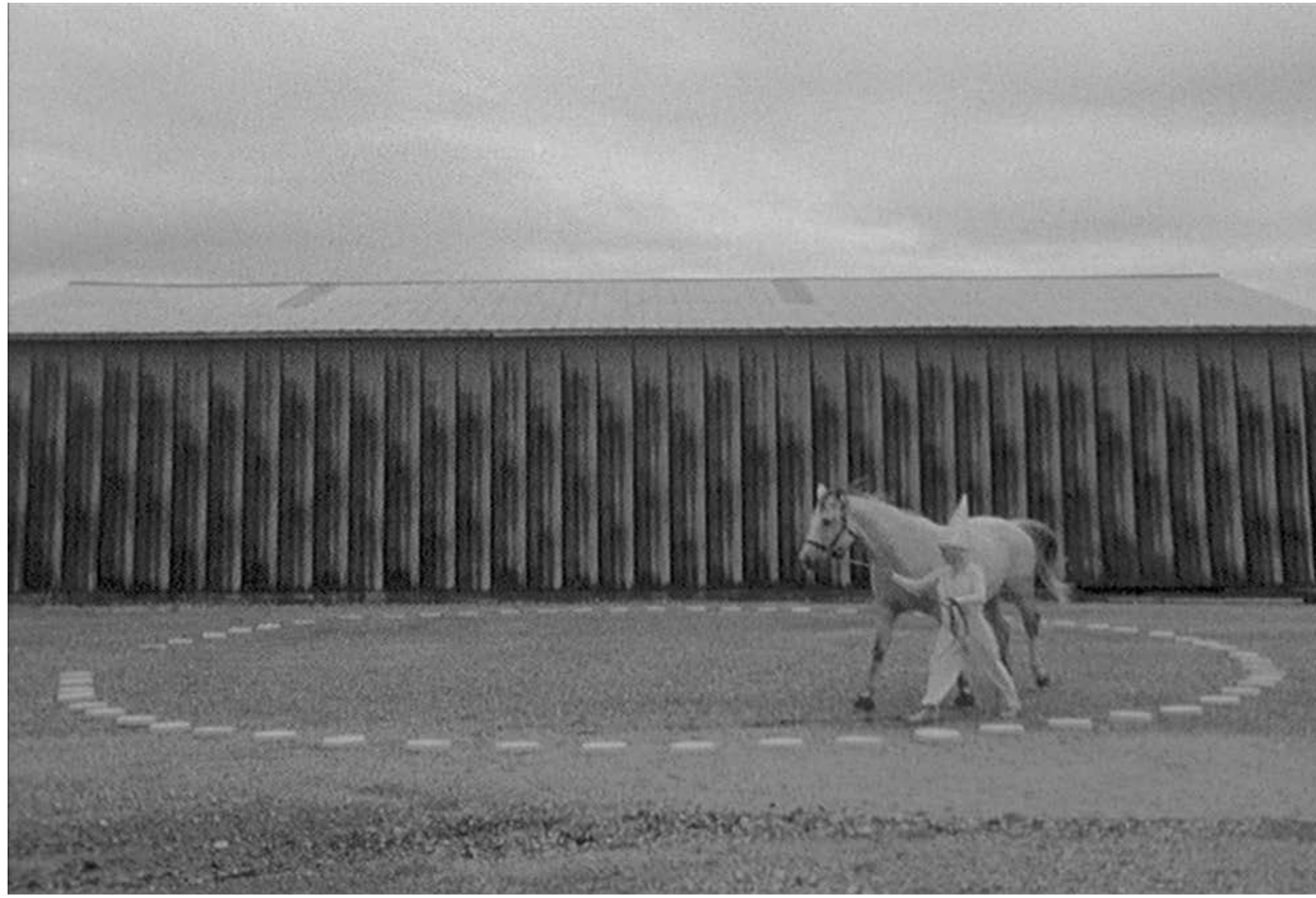
Alison Crocetta, A Circus of One , a 16mm black and white film in collaboration with composer Jason Treuting, 2011. Photo credit: 16m black and white film still

At the heart of this exhibition will be the premiere of A Circus of One (Act II) , a 30-minute event comprised of seven performance actions that occur within the intimate setting of a 20-foot-wide ring. For this project, she has joined forces with composer/musician Zac Little of the band Saintsenecca. Little's haunting and spacious music creates the soundscape for Crocetta's mesmerizing performance that runs the gamut from the absurd to the trance-inducing as she interacts with a large, shape-shifting wooden horse. In close proximity to this work, the CAC will present a large-scale projection of her 16mm black-and-white film, A Circus of One (scored by Jason Treuting), and related wooden sculptures that were used in the film's actions.