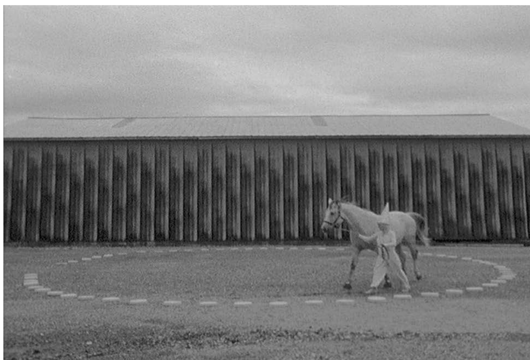
Alison Crocetta, A Circus of One , a 16mm black and white film in collaboration with composer Jason Treuting, 2011. Photo credit: 16mm black and white film still

At the heart of this exhibition will be the premiere of A Circus of One (Act II) , a 30-minute event comprised of seven performance actions that occur within the intimate setting of a 20-foot-wide ring. In close proximity to this work, the CAC will present a large-scale projection of her 16mm black-and-white film, A Circus of One and related wooden sculptures that were used in the film's actions.