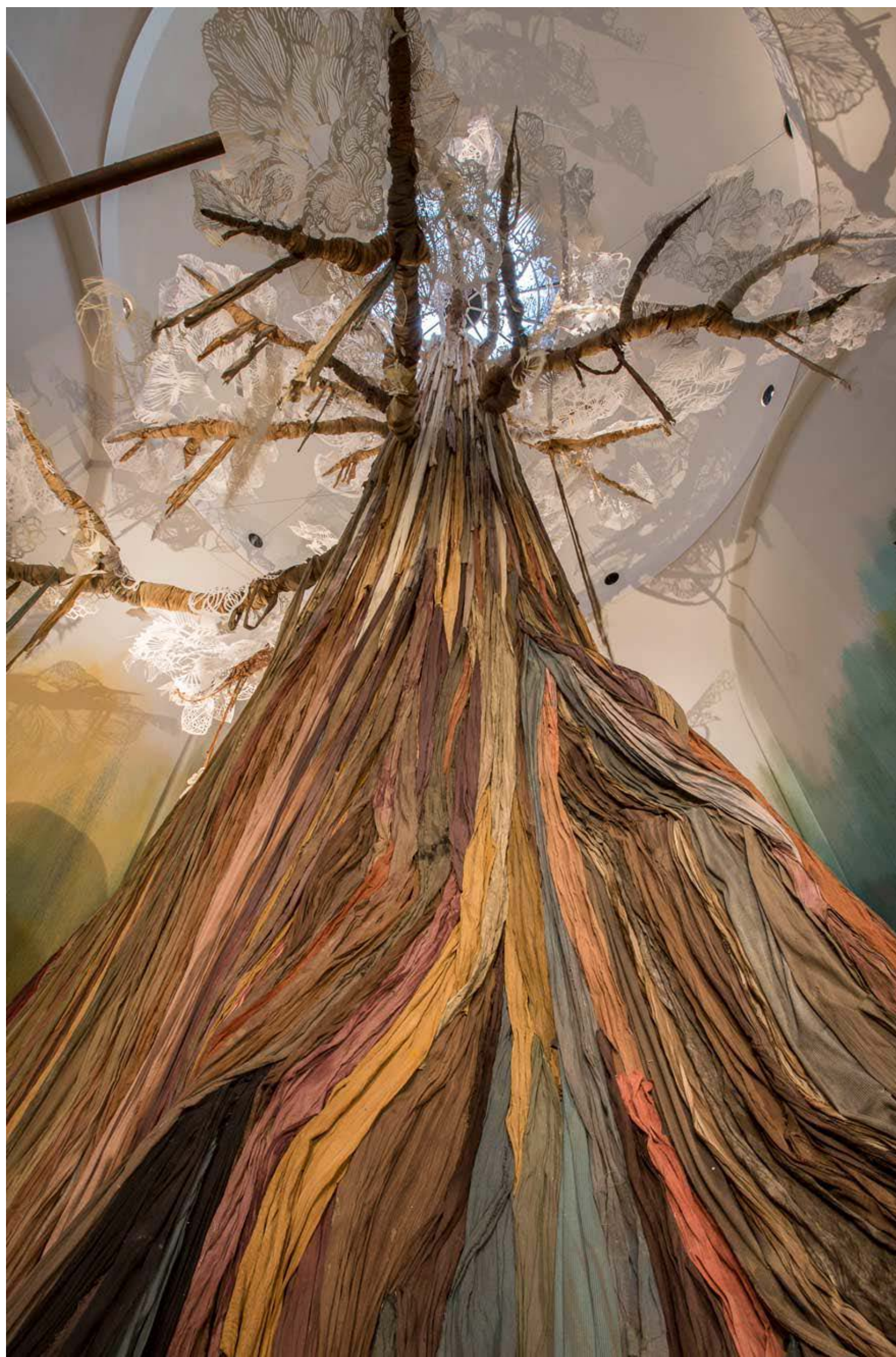
Swoon, Submerged Motherlands, 2014.

Curry uses drawing, printmaking, wheatpaste and cut paper to give life to faces and figures who take on an extraordinary presence when placed in public space. She explains, “I make [the figures] human-scale and close to the ground, so you have a one-on-one experience. I like to think of them as vessels of empathy.”