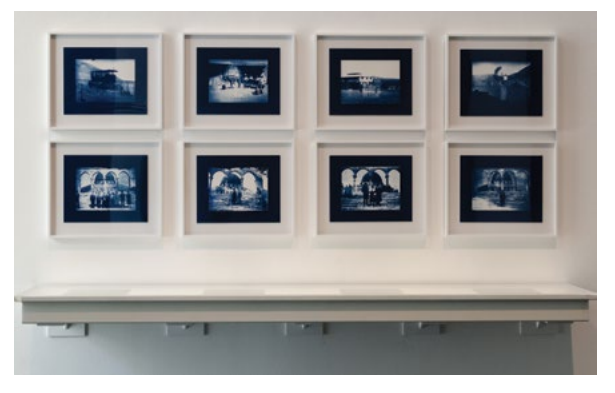
Un-Dividing History, 2017 8 Cyanotypes, 18 x 24 cm 8 inkjet prints on gelatin-treated-glass plates, 18 x 24 cm