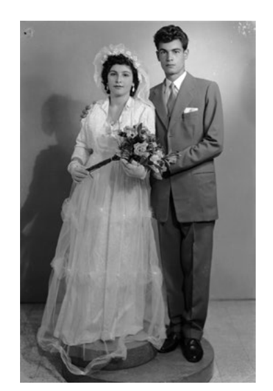
The End of Love, 2013 150 black and white inkiet prints from the archive of Studio Shehrazade / Hashem el Madani 18 x 11.7 cm each