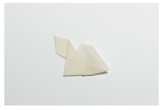
Letter to A Refusing Pilot. Paper Planes. 2013 8 paper planes. polyamide, selective laser sintering Various sizes