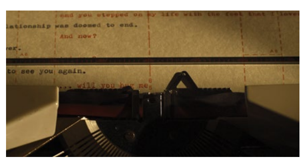
Tomorrow Everything will be Alright, 2010 HD video 12 minutes