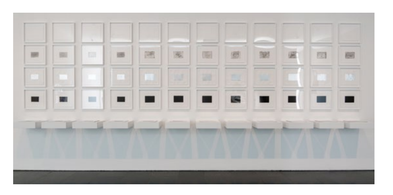
Against Photography, 2017 48 prints (blind emboss, Aluminum foil, intaglio and Chine-collé), 27.5 x 31 cm each 12 Aluminum plates, 24 x 28 cm