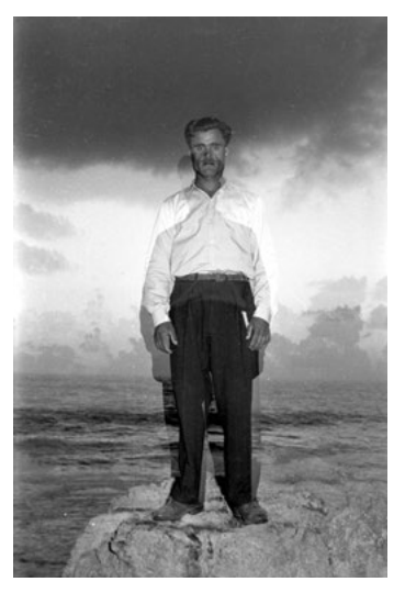
Double exposure with one Flash Strike, 2018 From the archive of Studio Shehrazade / Hashem el Madani Inkjet prints 120\,x\,80 cm each Courtesy of the Artist