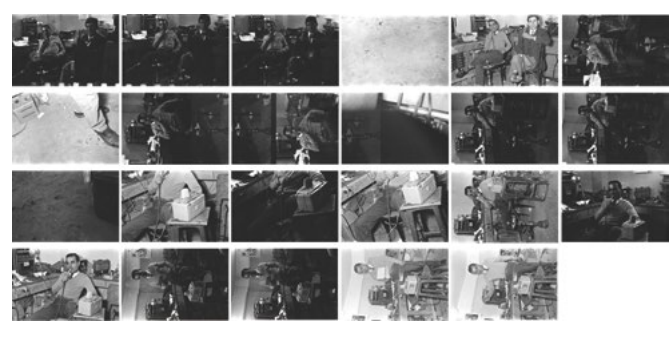
Flash Failure | Photo-Log Sheet, 2007 From the archive of Studio Shehrazade / Hashem el Madani Inkjet print 40 x 20 cm Courtesy of the Artist