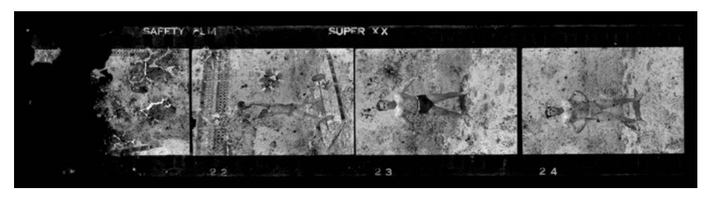
Bodybuilder 35mm negative strips, 2011 From the archive of Studio Shehrazade / Hashem el Madani 4 Inkjet prints 98 x 50 cm each Courtesy of the Artist