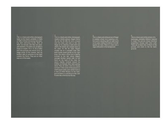
Letter to A Refusing Pilot. Hagai Tamir's photographs, 2013 Vinyl text on wall