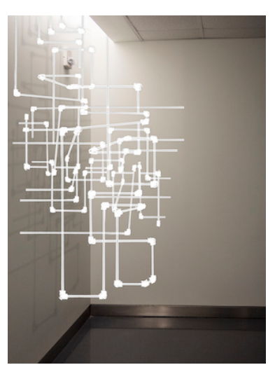
Prop 4 (rendering) PVC pipes, adhesive, metal Location: Women's restroom

Henkin emphasizes that the sculptures in Props aren't designed with traditional beauty or grace in mind; they are literal interventions whose conceptual basis is to encourage viewers to more deeply consider an architect's gestural, formal, and functional choices. With materials including PVC pipes, wires, and other construction supplies—some even sourced from the museum's own utility closets— Props poses the additional question of how context and presentation affect artviewing in an institutional setting. Locations and materials range from the mundanely functional (a PVC pipe- based work