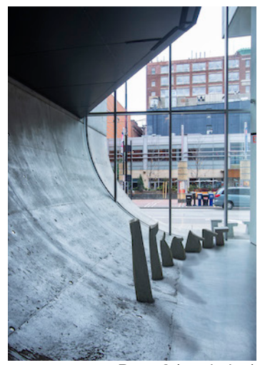
Prop 2 (rendering) Concrete, board, foam Location: Ground floor

"Lauren's uncanny animation of spaces that are habitually overlooked within the museum speaks to a larger, more holistic consideration of an iconic structure that can seem overdetermined, and even overbearing. What happens when the space is interrupted by peculiar agents living in spaces previously unauthorized?" Adds Raphaela Platow, the Alice and Harris Weston Director and Chief Curator: "Henkin's pieces will invite visitors to consider with greater care and nuance often overlooked architectural details and spaces. Contemplating the sculptures will certainly rearticulate their spatial context."