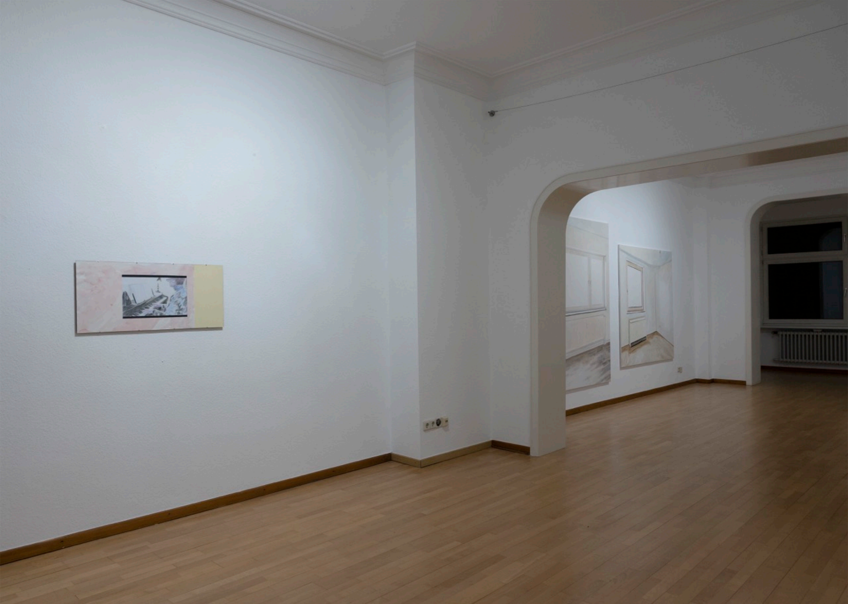
Installation view, Neue Charakter , Lucas Hirsch, Düsseldorf, 2021