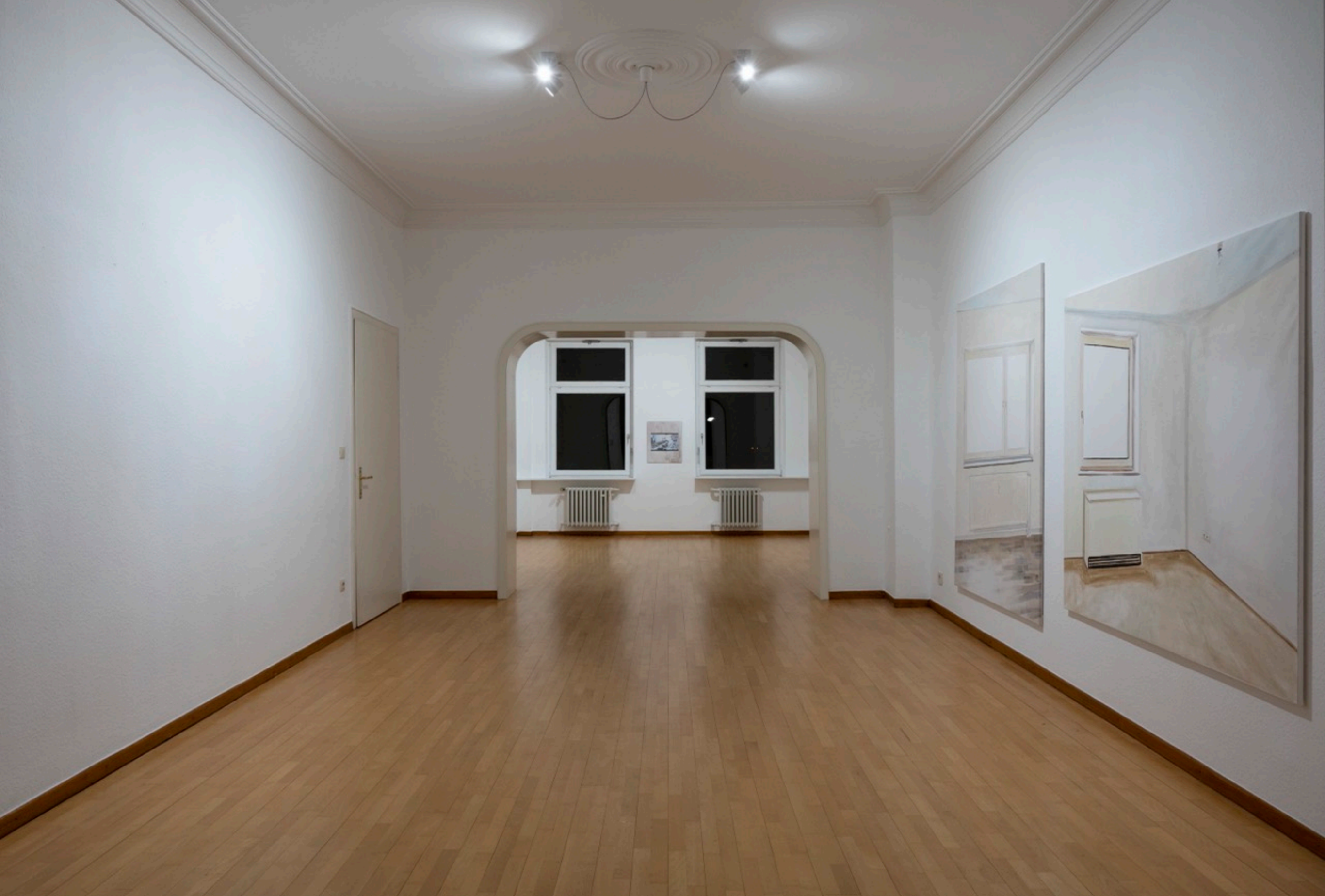
Installation view, Neue Charakter , Lucas Hirsch, Düsseldorf, 2021