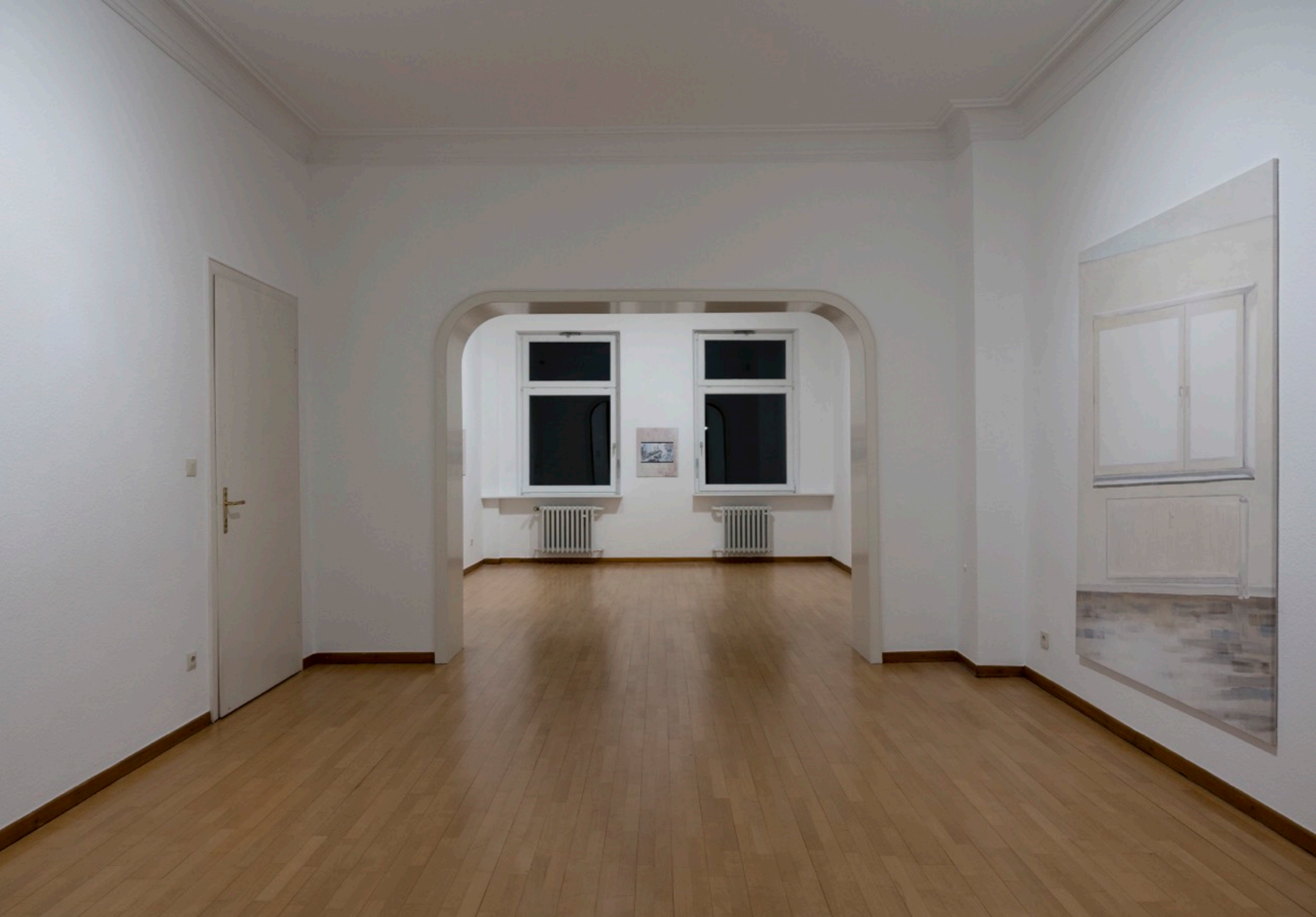
Installation view, Neue Charakter , Lucas Hirsch, Düsseldorf, 2021