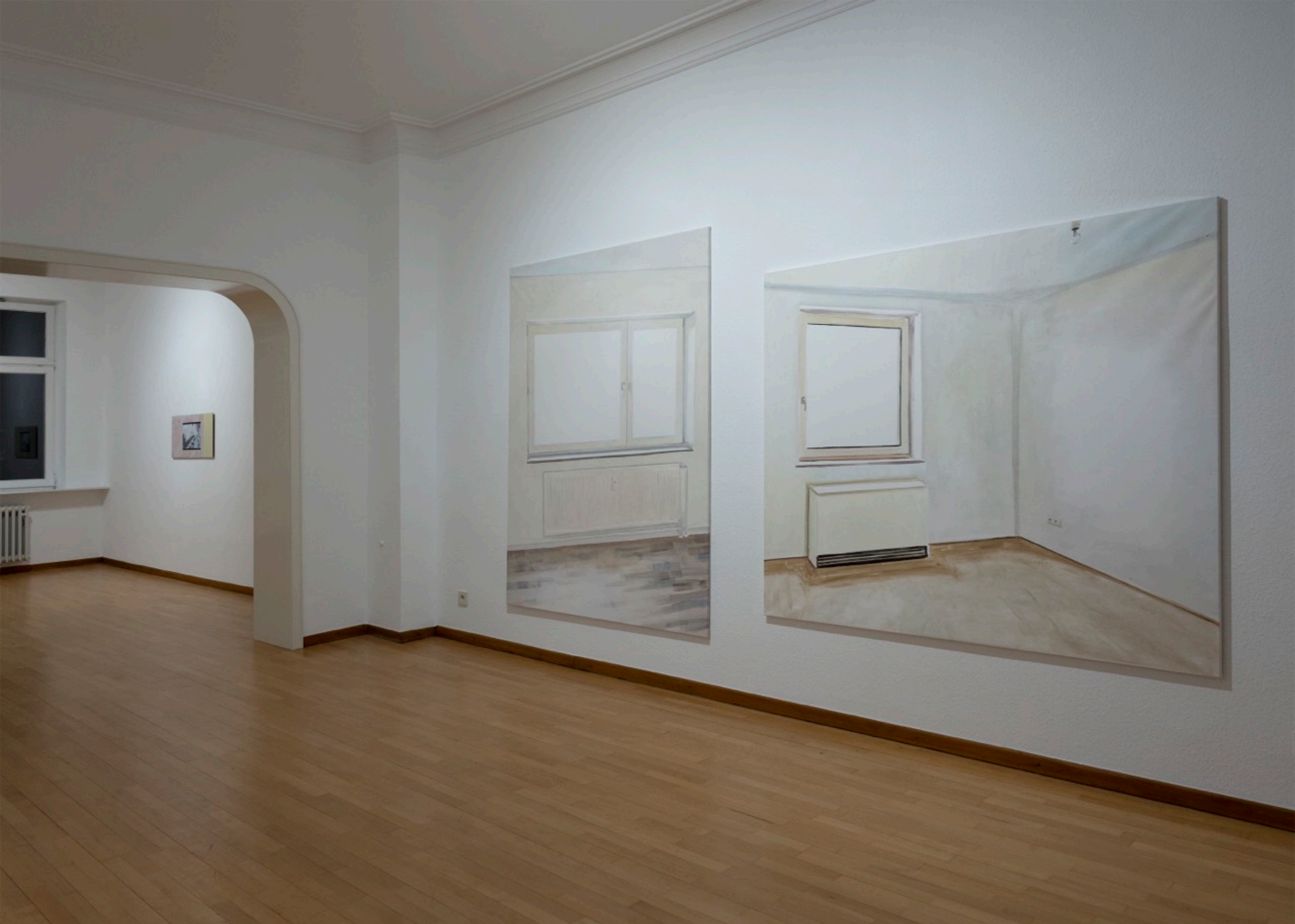
Installation view, Neue Charakter , Lucas Hirsch, Düsseldorf, 2021