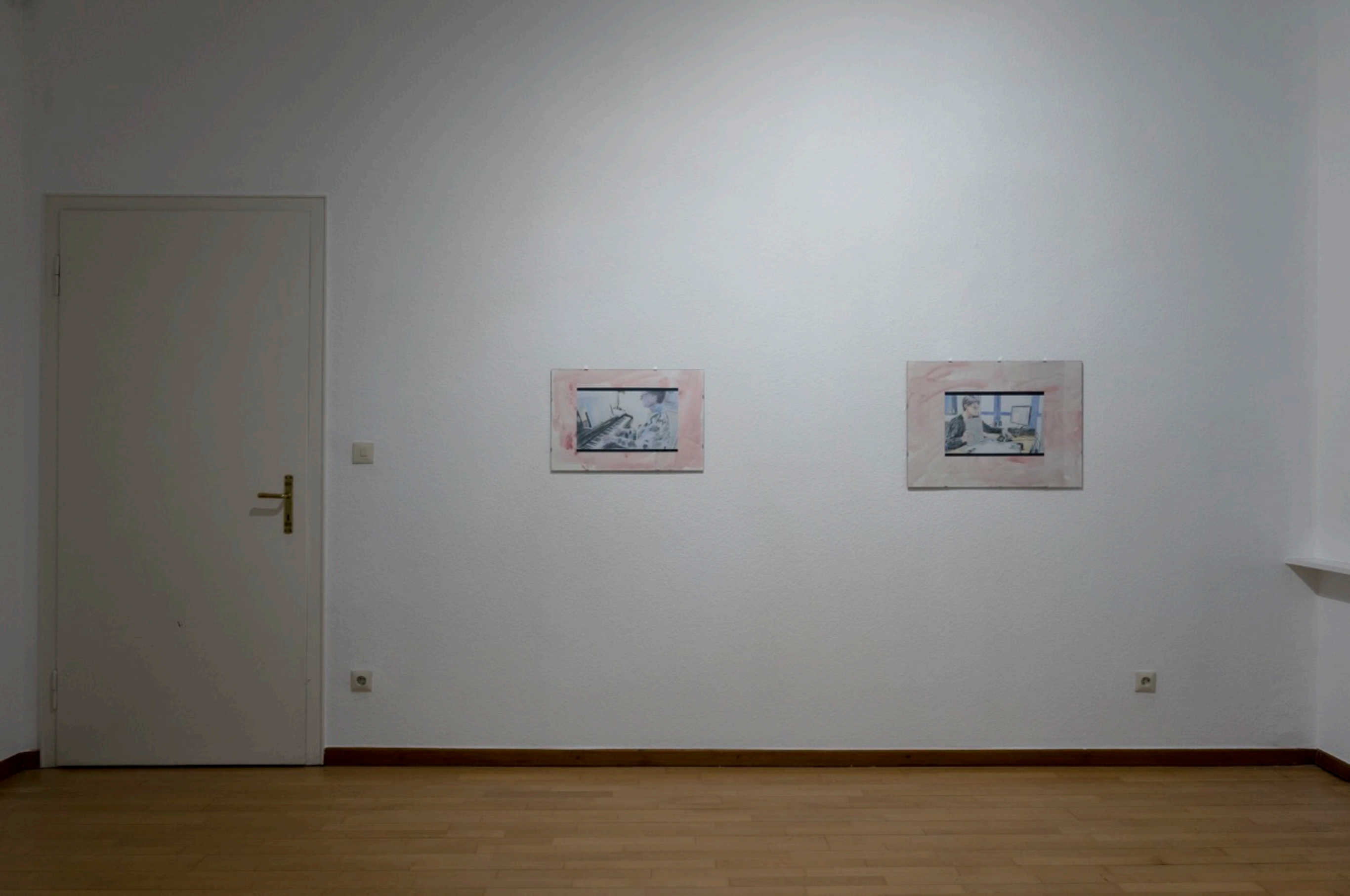
Installation view, Neue Charakter , Lucas Hirsch, Düsseldorf, 2021