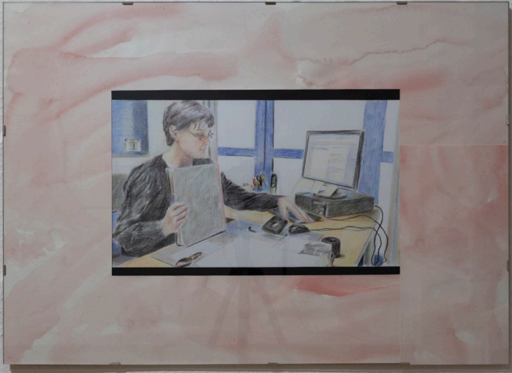
Untitled, 2021 Pencil and colored pencil on paper, watercolor on paper, clip frame 50 x 70 cm