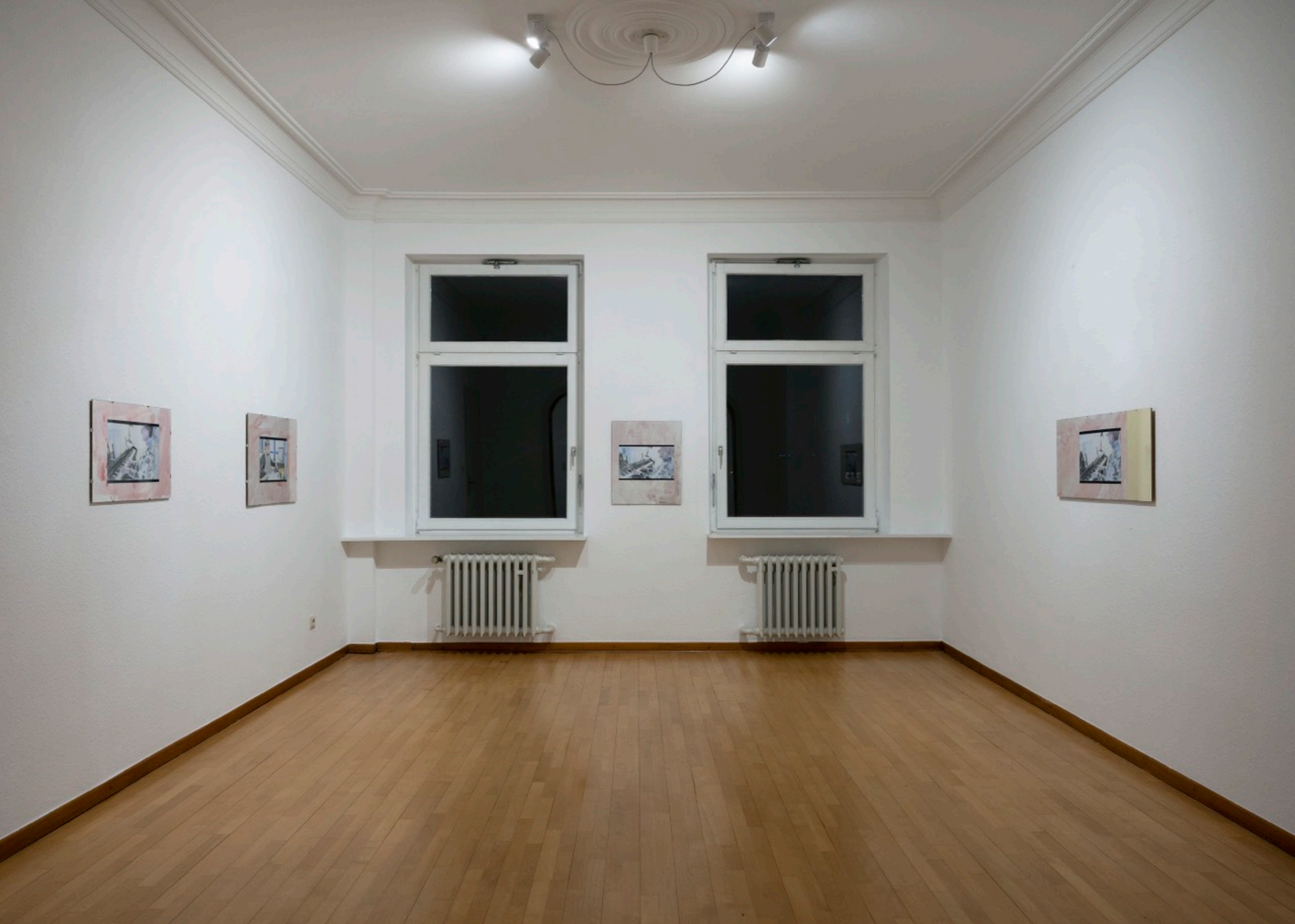
Installation view, Neue Charakter , Lucas Hirsch, Düsseldorf, 2021