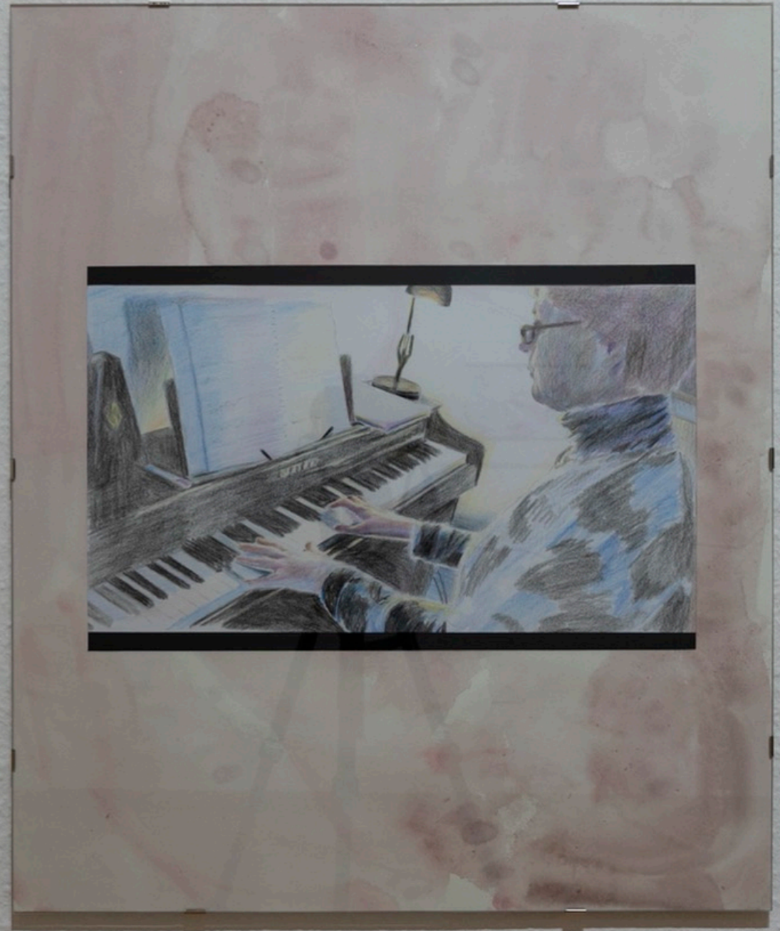
Untitled, 2021 Pencil and colored pencil on paper, watercolor on paper, clip frame 60 x 50 cm