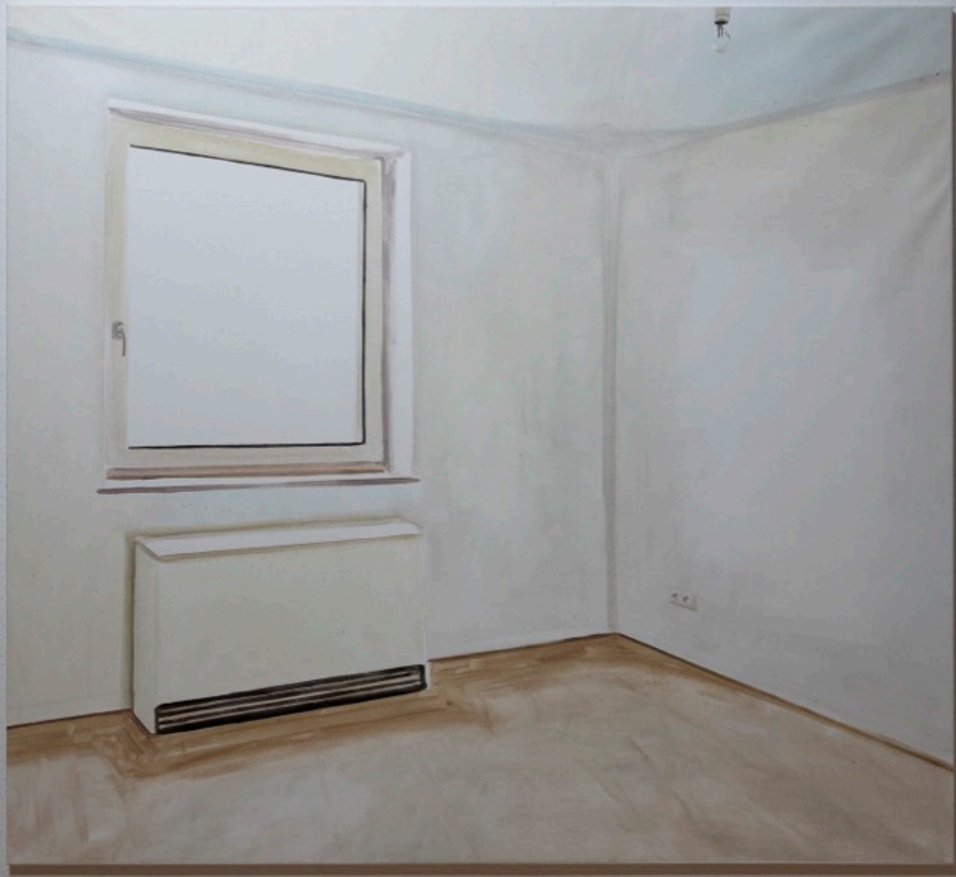
Untitled, 2021 Acrylic on canvas 160 x 170 cm