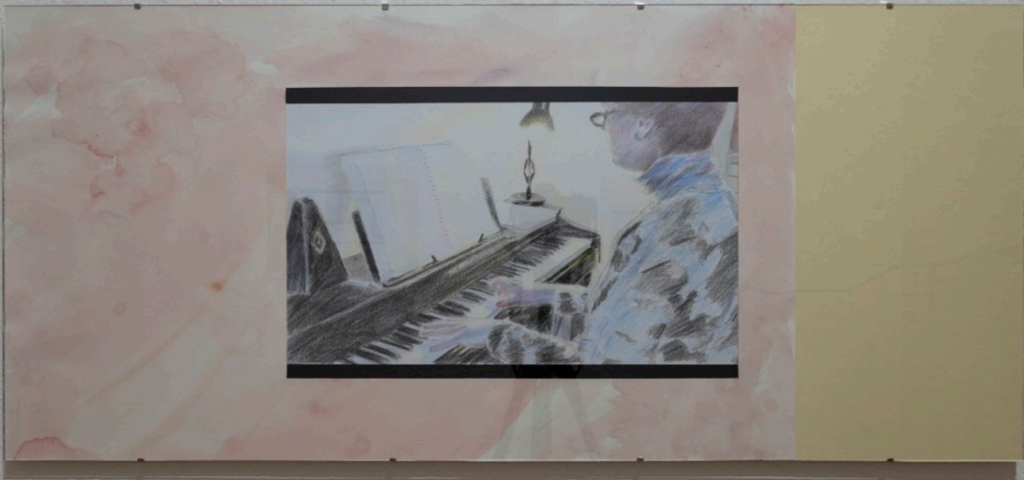
Untitled, 2021 Pencil and colored pencil on paper, watercolor on paper, custom made clip frame 40 x 90 cm