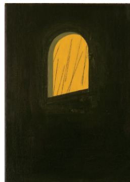
Top left : The moon and the crow 2020 oil on canvas, 100 × 72.7 cm