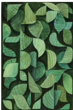
Bottom right : Lighthouse 2021 oil on canvas, 38 × 45.5 cm