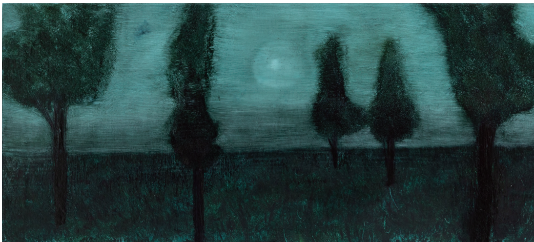
The plain of Holland 2020 oil on canvas 40 x 90 cm