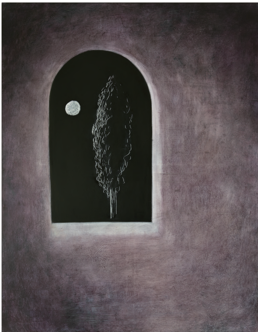
Moonlight 2021 oil on canvas, 116.7 × 91 cm