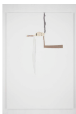
Richard Aldrich spider/bird 2009 Cloth and wood on linen 84 x 58 inches 213.4 x 147.3 cm DEP-RA-0010