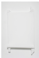
Richard Aldrich Future painting #2 2007 gessoed muslin 20 x 16 inches 50.8 x 40.6 cm DEP-RA-0021