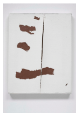
Richard Aldrich Poem 2009 Oil and wax on cut canvas 14 x 11 inches 35.6 x 27.9 cm DEP-RA-0018