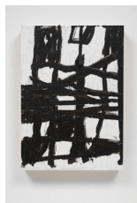
Richard Aldrich two and baby 2009 Oil, wax & oil bar on panel 13.5 x 10 inches 34.3 x 25.4 cm DEP-RA-0020