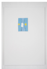
Richard Aldrich To be titled 2009 Oil and wax on panel on cut linen 84 x 58 inches 213.4 x 147.3 cm DEP-RA-0011