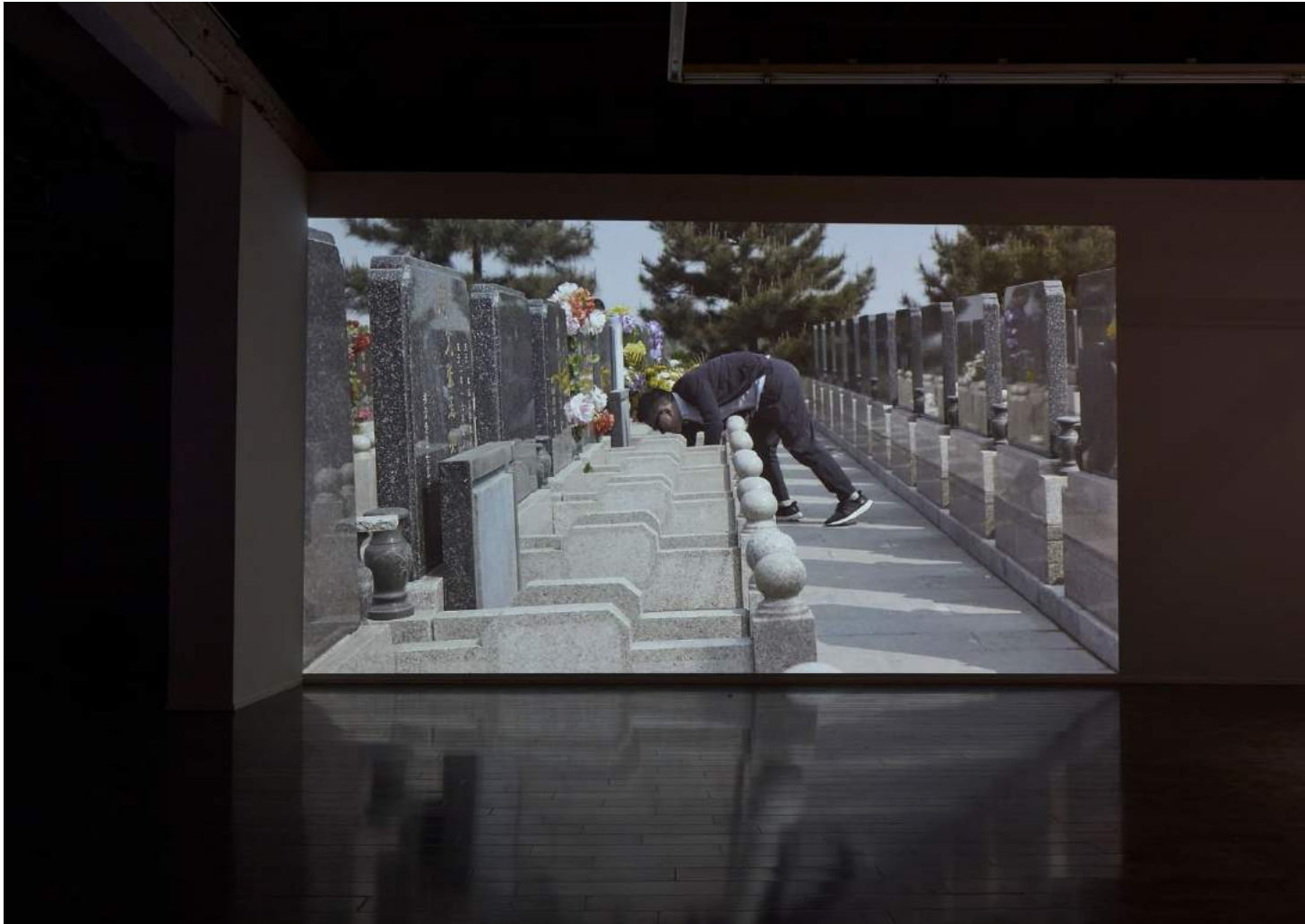
《灵山》 LING SHAN 展览现场 Exhibition view