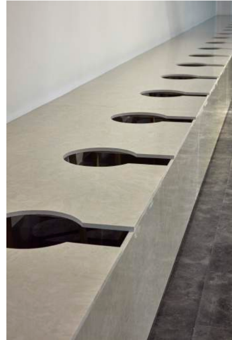
《公共》 Latrine 局部 Detail