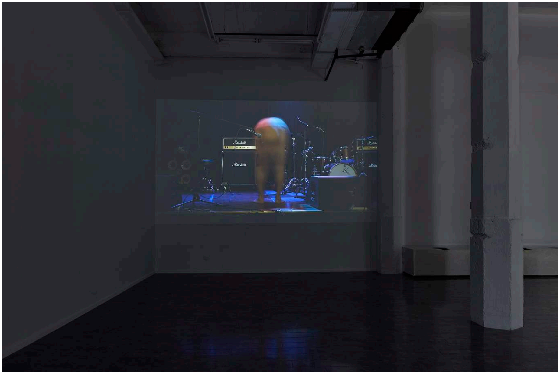
《狂热》 The Fanatic 展览现场 Exhibition View