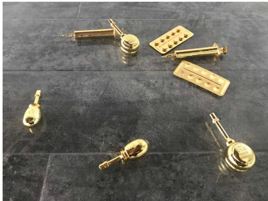
《公共》 Latrine 局部 Detail