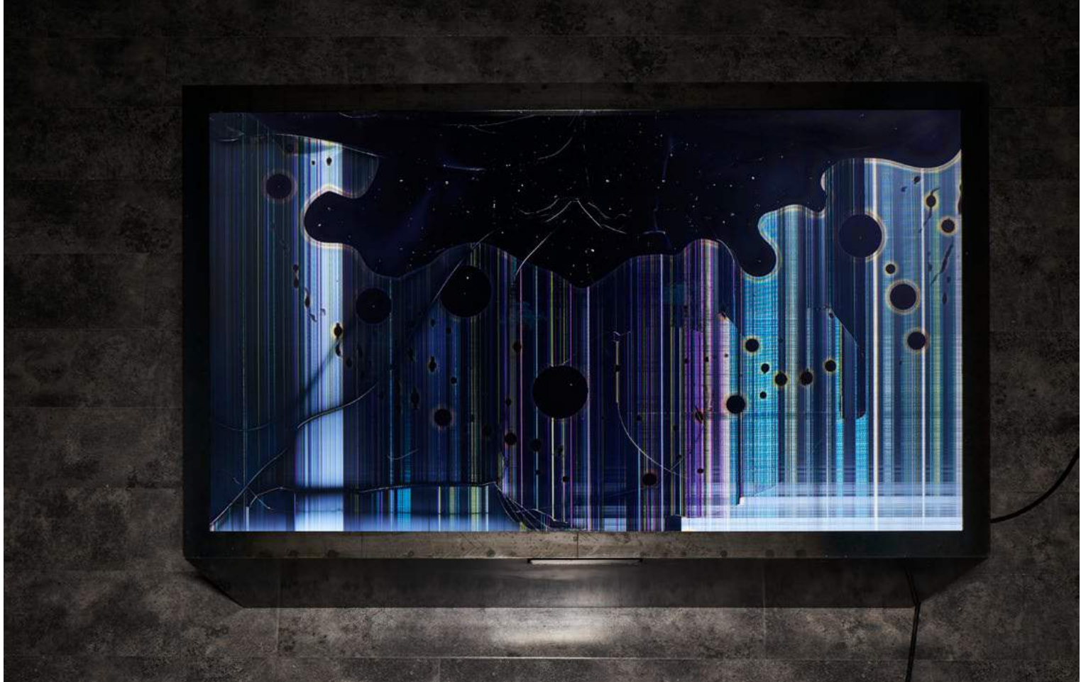
《蓝图》 Blueprints 局部 Detail