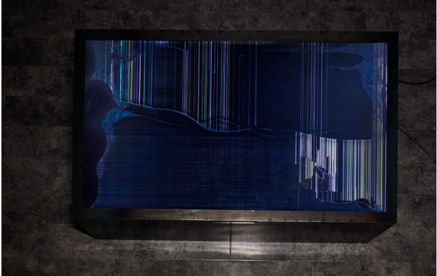
《蓝图》 Blueprints 局部 Detail