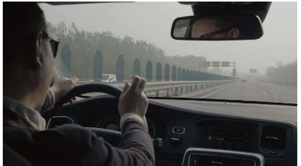
《灵山》 LING SHAN 录像截屏 Video Still