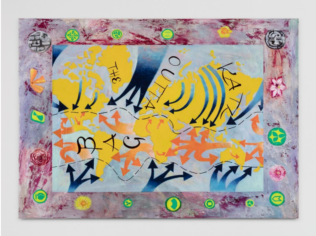
Katz Outta The Bag, 2018, Oil and enamel on canvas, 125 x 175 cm