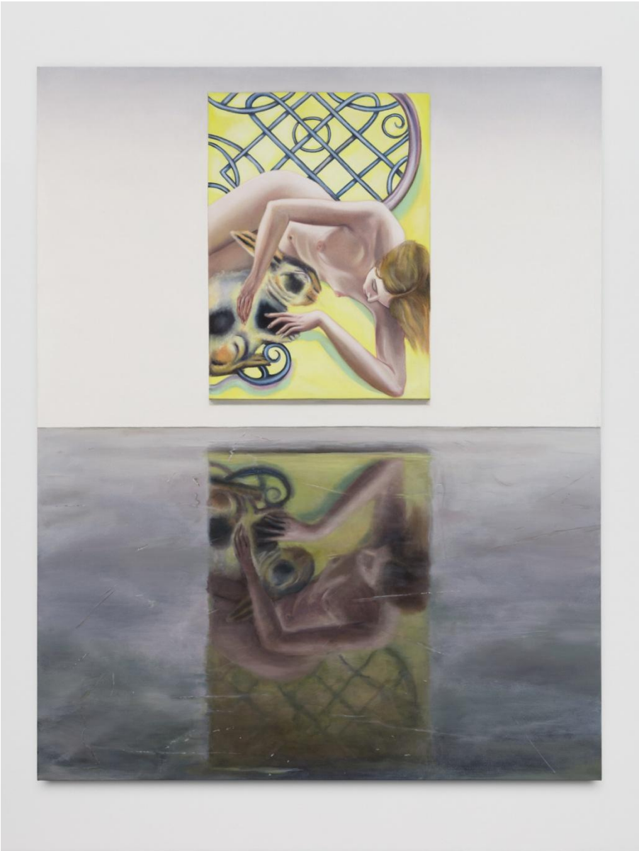
pb , 2018, Oil, acrylic and sand on canvas 240 x 190 cm