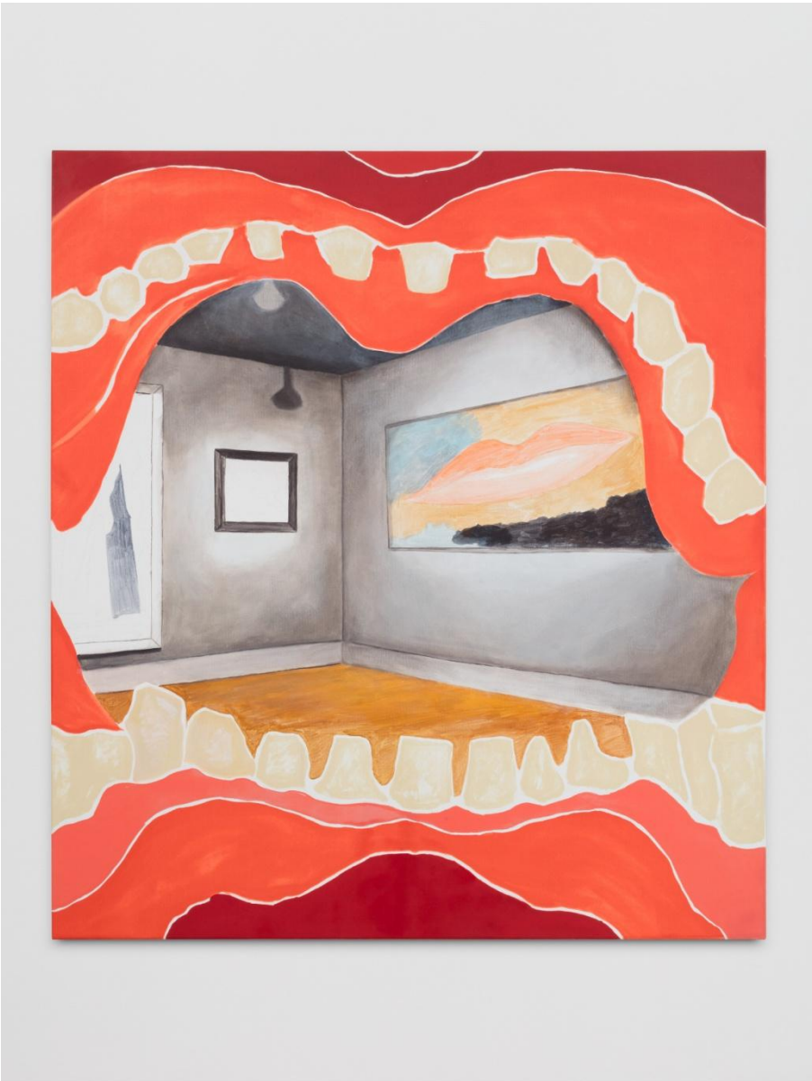
Café Man Ray at the Copley Galleries, LA, 1949, 2018, Oil and acrylic on silkscreen, 160 x 145 cm