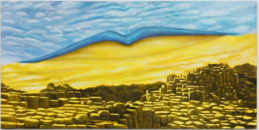
Phil Lips, 2018, 90 x 180 cm, Oil and acrylic on canvas