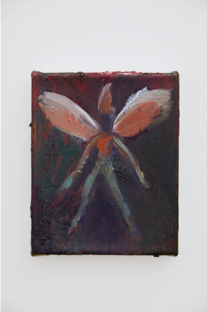
West Bund Fairy , 2018, Oil and wax on canvas, 13.5 x 16 cm