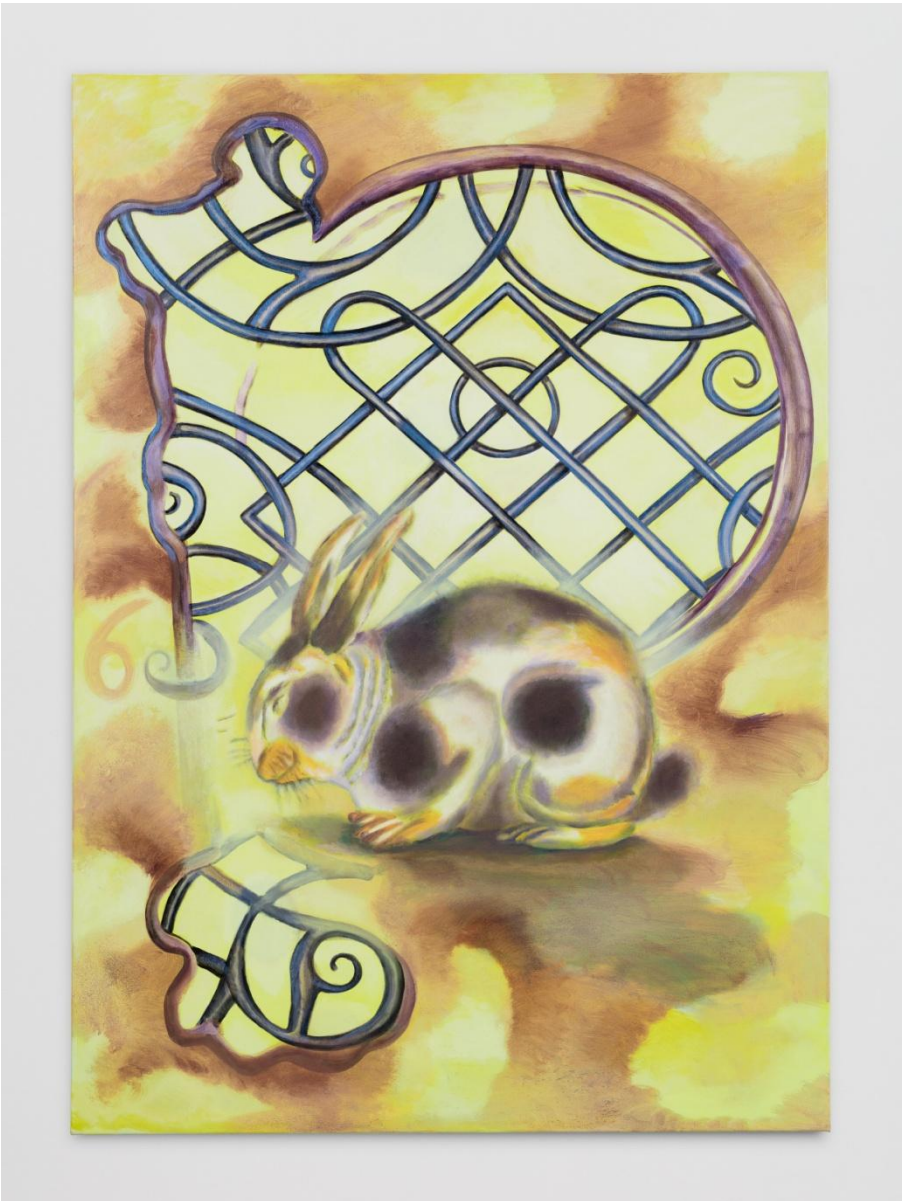
Bowery (Immaculate Conception) , 2017 – 2018, Oil and sand on canvas, 175 x 125 cm