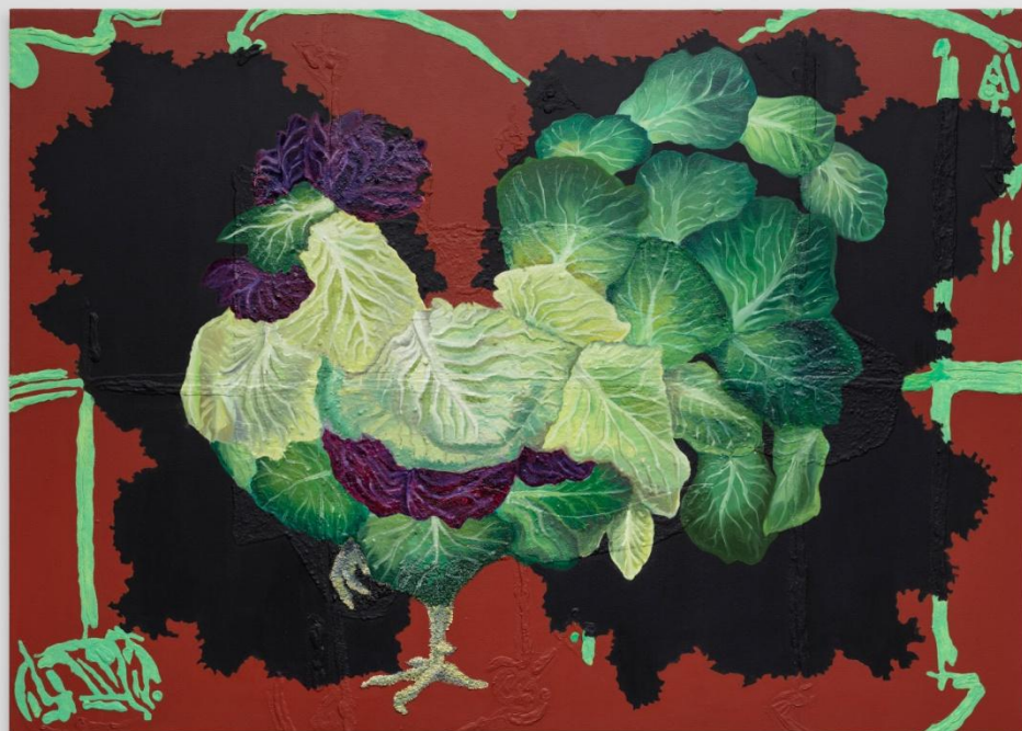
Cabbage Cock , 2016 – 2018, Oil, acrylic, sand and rice on canvas, 125 x 175 cm