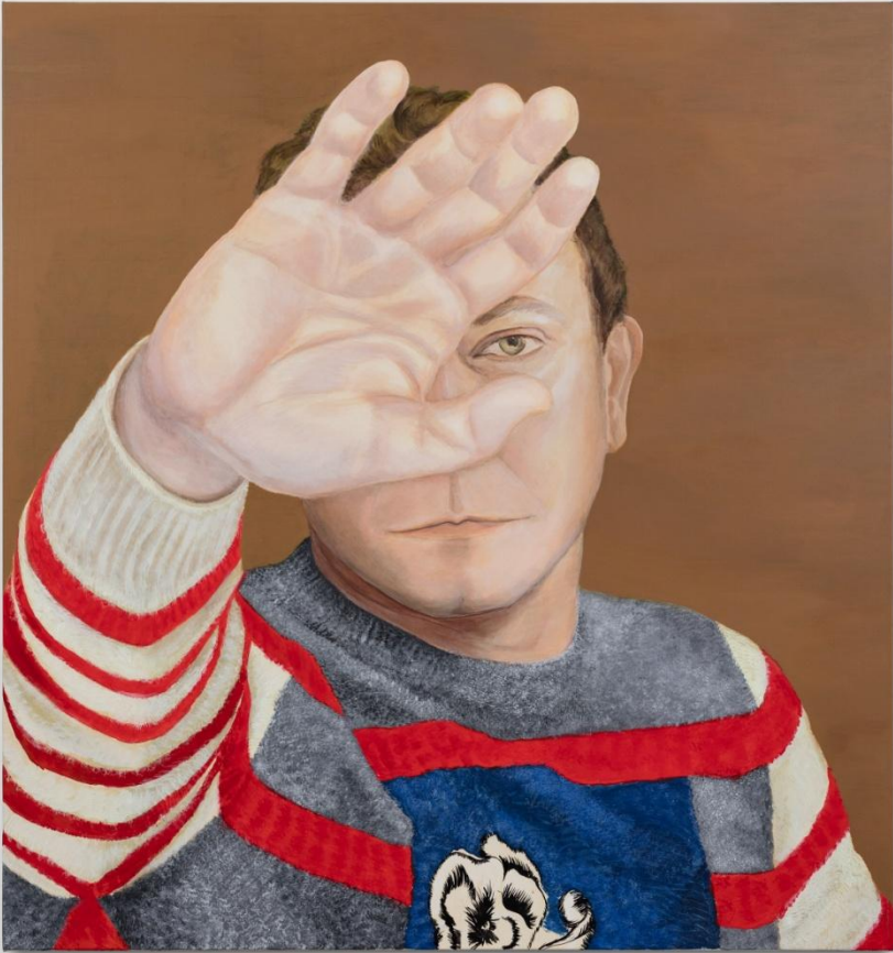
Fusion (PC for PP), 2018, Acrylic on canvas, 170 x 160 cm