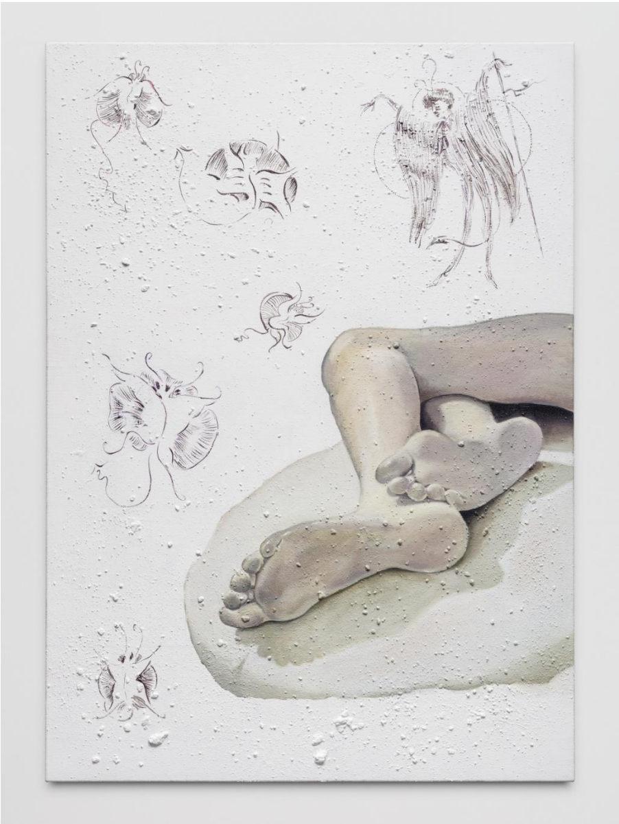
JMW , 2018, Oil, acrylic and sand on linen, 175 x 125 cm