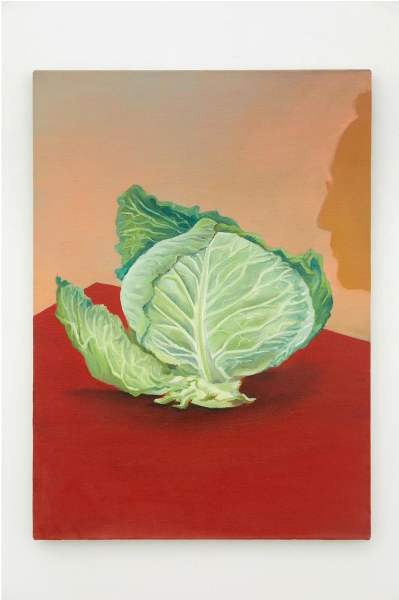
Void, 2018 Oil on Canvas, 71x51cm