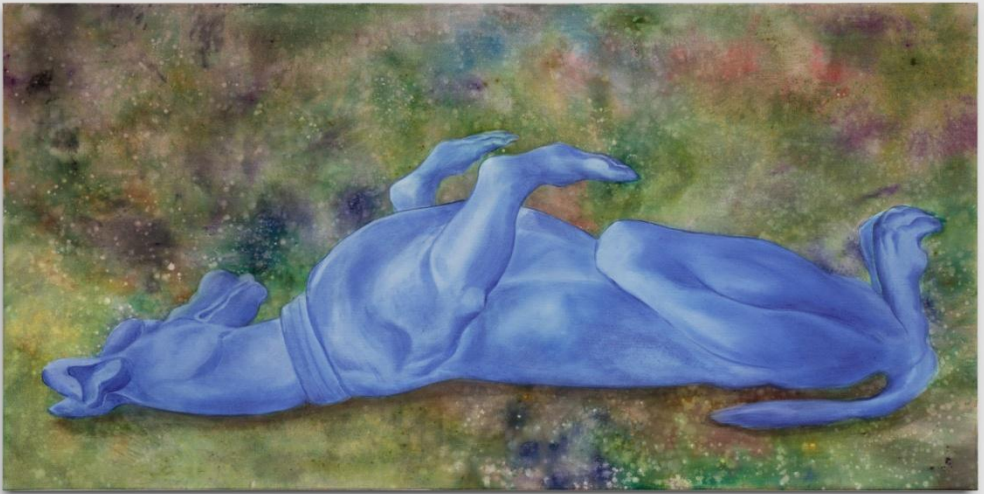
Back down , 2018, Oil, acrylic and pigment on canvas, 90 x 180 cm