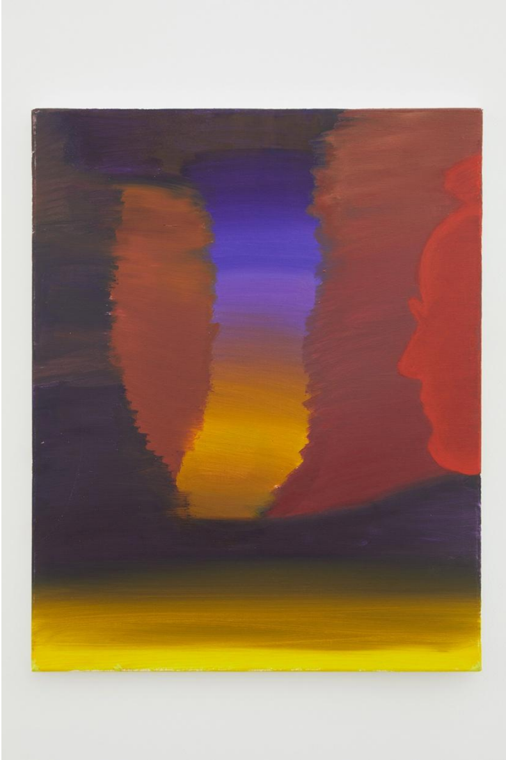
Cabbage (and Philip) No.15, 2018, Oil on linen, 50 × 40 cm