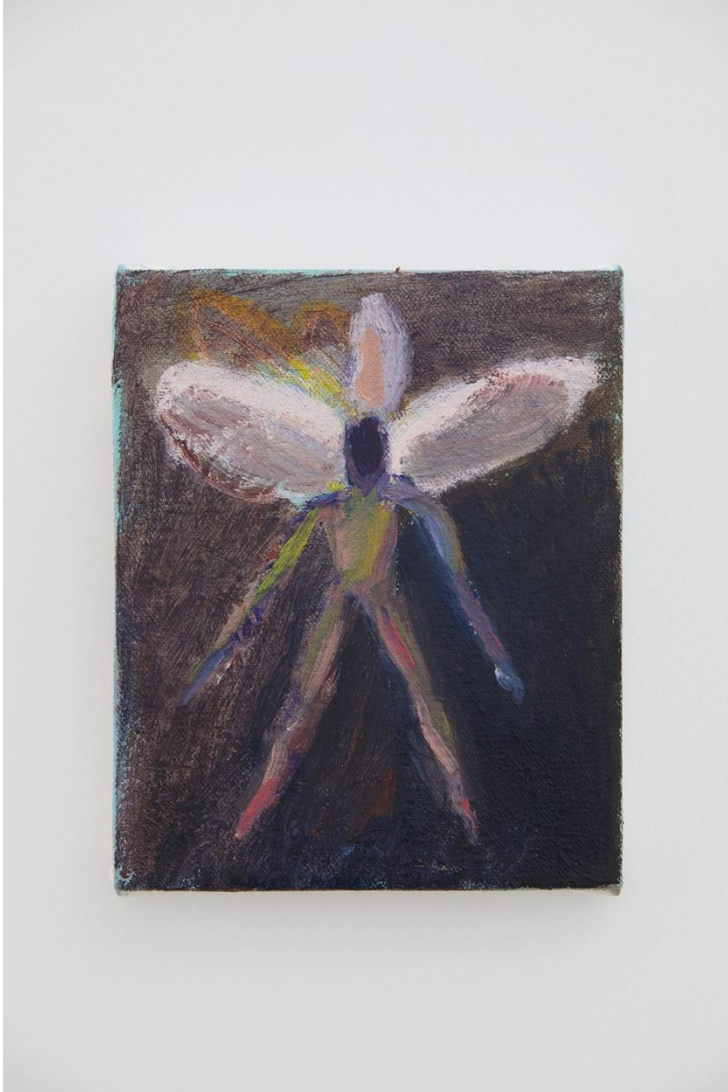
021 Fairy, 2018, Oil and wax on canvas, 13.5 x 16 cm