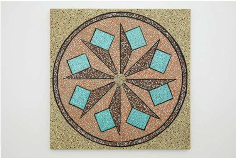
Tile , 2018, Oil on linen, 90 x 90 cm